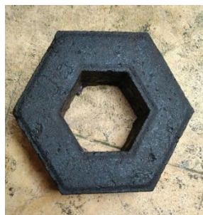
Figure 3: Grass Block from plastic waste.