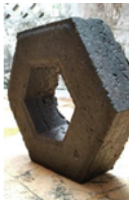
Figure 2: Grass Block from plastic waste.