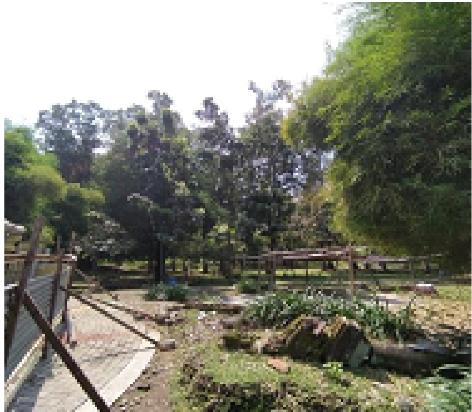
Figure 2: Balekambang Urban Forest Park is closed.

Softscape refers to the live horticultural elements of a landscape. Softscaping can include flowers, plants, shrubs, trees, and flower beds. The purpose of the softscape element is to give the landscape garden characteristics, create a good impression, atmosphere, and sensitivity to the people around. Softscape on soft elements for plants is usually a combination of shrubs, vines, shade plants, flowering plants, and cover crops (such as purslane, blue eyes, onions, and grass). In addition to plants, water is also a soft element that can be added to the garden.