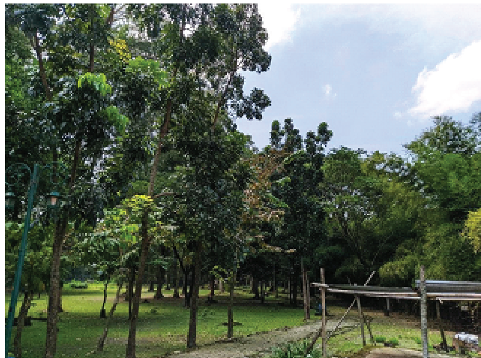
Figure 3: One of the spots of the urban forest in Balekambang City Park.