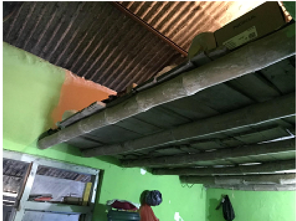
Figure 2: Ra' para'an in one of the houses in Dalpenang Village.

The use of ra'para'an not only by local residents, but also applied in SMKN 1 Sampang, especially in the teacher's room (see Figure 3). This school is located in Dalpenang Village, which is affected by floods every year. In 2012 and 2016 this school was affected by heavy flooding because of its location very close to the meander of the Kemuning River. This school is submerged up to 1.5-2 meters. Many electronic items and important files belonging to teachers and schools were damaged, even lost in the flood currents. To anticipate this, the teachers and education staff make ra'para'an in the teacher's room and several other rooms. That way, the belongings of the school and the teachers can be saved when the water comes in a high volume [27].