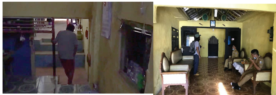
Figure 5: Conditions of a house in Dalpenang Village.

valuables more safely. Building a loteng is a fairly effective mitigation effort, but the problem is that it costs a lot of money to build it, and not everyone can do it. While the upper middle class can build loteng for flood mitigation, the lower middle class people prefer to raise the floor of their house every time there is a big flood. This effort was made because it did not have a lot of money [19] [22] [27]. The floor height that even reaches 1.5-2 meters. When an adult enters one of the rooms in the house, they have to look down because their head can touches the upper door frame (see Figure 5).