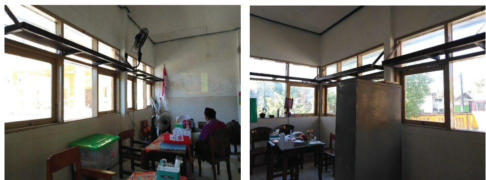
Figure 3: The location of ra'para'an in the teacher's room at SMKN 1 Sampang.

The use of ra'para'an not only by local residents, but also applied in SMKN 1 Sampang, especially in the teacher's room (see Figure 3). This school is located in Dalpenang Village, which is affected by floods every year. In 2012 and 2016 this school was affected by heavy flooding because of its location very close to the meander of the Kemuning River. This school is submerged up to 1.5-2 meters. Many electronic items and important files belonging to teachers and schools were damaged, even lost in the flood currents. To anticipate this, the teachers and education staff make ra'para'an in the teacher's room and several other rooms. That way, the belongings of the school and the teachers can be saved when the water comes in a high volume [27].