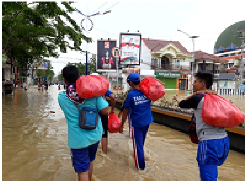
Figure 6: Distribution of logistics by Tagana (Taruna Siaga Bencana) & Gaspala (Gerakan Siswa Pecinta Alam).

The wisdom of gotong-royong can also be seen when receiving disaster relief, both the government relief and the community groups (see Figure 6). If the team of disaster relief passes in a flood-affected area, people who see it will scream with the word " bantuan-bantuan! " (means: relief-relief). They doing this in order to get people around him out from the home. If one family does not go out because of take a rest, their neighbors will ask for more disaster relief from the teams to be distributed to neighbors who have not received a relief [25] [27].