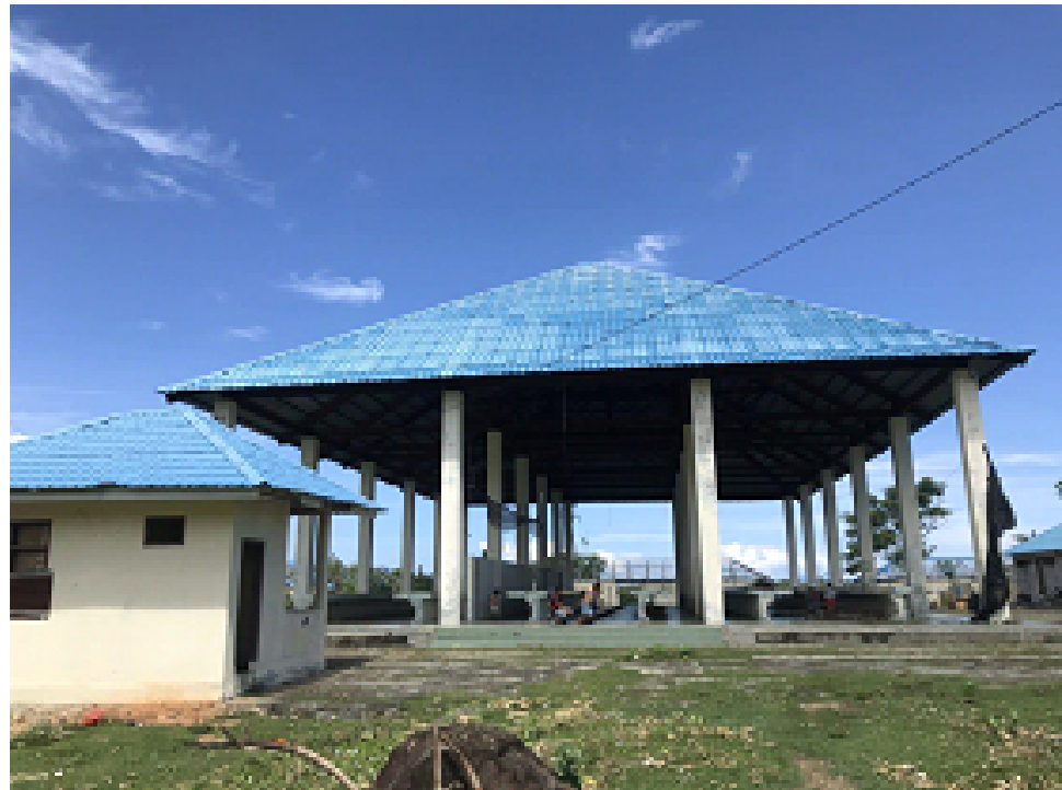
Figure 3: The Market.

After 16 years of the tsunami, there is no difference in the survivors' satisfaction both in the relocation and non-relocation areas related to the available electricity. The survivors' satisfaction in the non-relocated areas regarding to PDAM or the availability of clean water still remains the same after 16 years of the tsunami. This satisfaction occurred due to the availability and the sufficiency of clean water and the good management process.