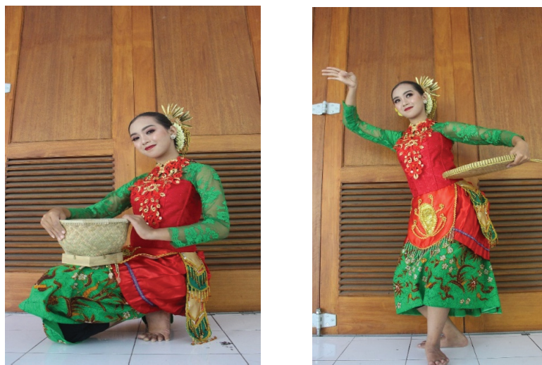
Figure 3: dance makeup and costumes (dok: wara,2021).