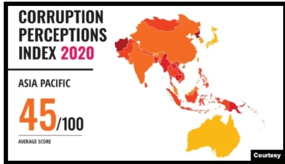
Figure 2: (Source: Transparency International).

of its seriousness in enforcing the merit system in the government environment, the government has ratified Law No. 5 of 2014. Furthermore, the ASN Law is supplemented by Government Regulation No. 11 of 2017 on Civil Servant Management.