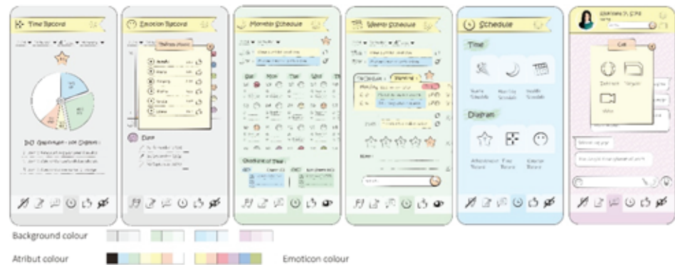
Figure 2: Interface Ace Diary

to get to other pages [11]—the interface visualization of the concept shown in Figure 2 and the buttons in Figure 3.