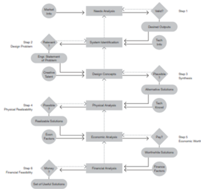
Figure 1: Asimov's Design Model

application's mandatory use to all Universitas Negeri Malang students will maintain prospective new consumers' income, which annually absorbs about 4 thousand new students [10]. Although the freemium version used by counselee while attending college, it is expected that the use of Ace Diary for four years will be the dependency and sustainability of use even if they have graduated and have to access premium series. This thinking is the result of analysis from the economic analysis stage.