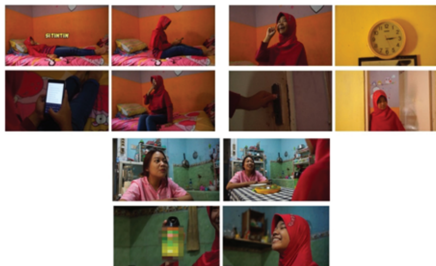
Figure 3: Screenshot from Film 2: opening, content, closing.

The opening of the second film begins by showing the figure of Tintin who represents a group of people with low literacy levels absorbing information using a smartphone. Here the figure of Tintin is presented in a satire way to flirt with groups of people who often misinterpret information circulating via smartphones.