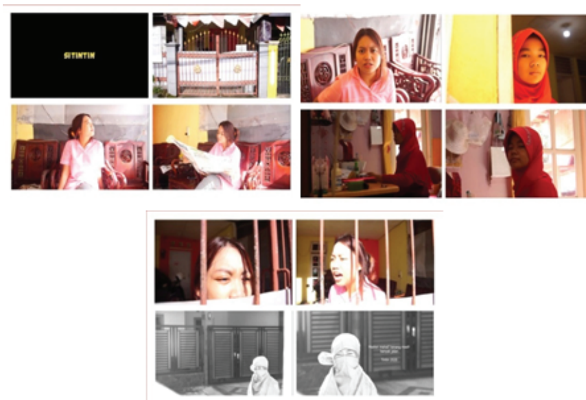
Figure 2: Screenshot from Film 1: opening, content, closing.

First film opens with the introduction of the character of Tintin’s sister, who is described as a middle-aged woman with a high level of literacy by reading the newspaper as her preferred medium for gathering information. Tintin’s sister was sunbathing on pyjama while reading the newspaper. This represents a group of urban people who are have good literacy levels. Meanwhile, Tintin is described as a public who likes to search for information from the internet but does not do in-depth research on the information obtained so she experiences disinformation.