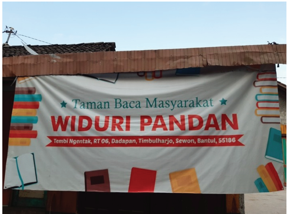
Figure 2: TBM Widuri Pandan

TBM has a function as a means or even a source of learning for the community, which is a place that has a recreational nature through reading material, enriches the experience and growth of community learning activities, can even function as a vehicle for developing life skills (Kalida, 2012). If the function of TBM can run optimally, the community literacy movement launched by the government can be said to be successful. However, based on observations and interviews in the field, there are several obstacles faced by TBM managers. These constraints are described as follows.