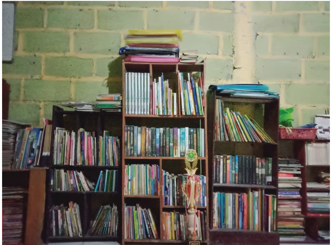
Figure 3: One of the reading corners in TBM Widuri Pandan

access information on TBM when getting an assignment from school or someone who is looking for a collection of test questions (TPA, TOEFL, or Civil Servant Test) when applying for a job.