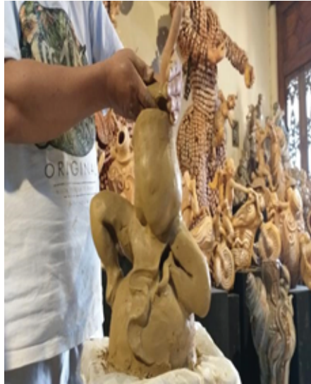
Figure 2: Artwork essential shaping process.(Source: Personal document, 2019)