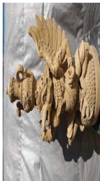
Figure 5: Ceramic artwork sourced from Garudeya Kamandalu relief idea, local artefact of Malang in Kidal temple.