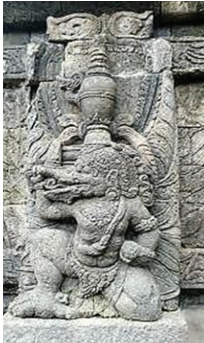
Figure 1: Garuda reliefs as creation idea