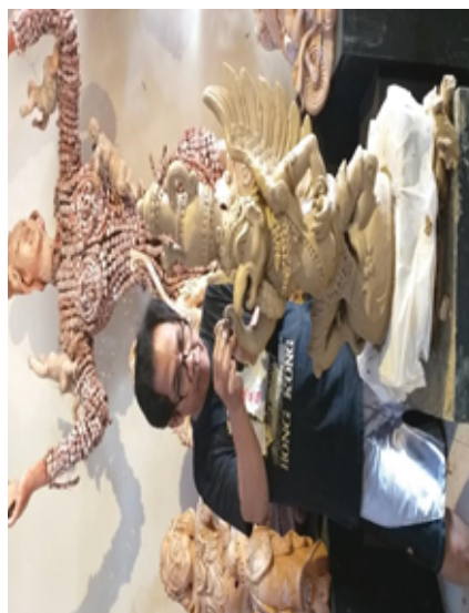
Figure 3: Artwork shape detail creation and improvement.

When the artwork surface is already smooth, the process continued with ornament creation in artwork surface. Artwork ornament creation is done when water level on shape surface is already low (Tri Atmojo, Wahyu dkk., 2014). Ornamentation is done by attach-twist technique and scratching technique. Attach-twist ornament creation is twisting plastic clays to small round shape, twisting, spiral, or scale shape. the twisting result then attached and pressed to surface of planned plate. Those attach-twist shape will create a decorative shape according to clays' characters which are attached and pressed (Tondo, Silverio, Bawer, & Evangelista, 2015).