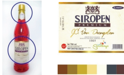
Figure 4: Color Palette of Siropen Premium Packaging Design

The colours that used in the Premium Siropen packaging design are tertiary and quartular colors. The arrangement of tertiary and quartular colours resulted in an less contrasted, dark, and harmonious appearance [4].