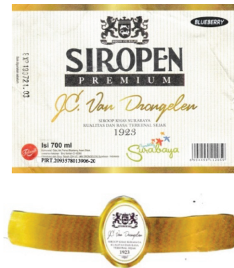
Figure 2: The label on The Body of The Bottle (above) and Label on The Seal of The Bottle (below)