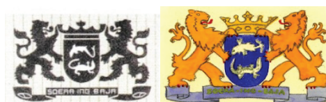
Figure 5: Emblem on The Package Siropen (Left) and Emblem of Surabaya City Year 1931 (Right)