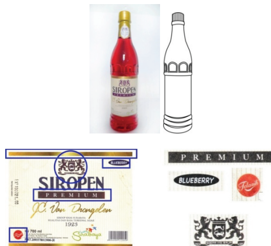
Figure 3: Forms Allignment of Siropen Premium Packaging Design

The shape of forms and the lines appear aligned, using geometric and regular shapes such as cylinders, straight lines and curves that tend to be geometric, geometric shapes like rectangles, circles, and ovals. The similarity, resemblance, and alignment of the elements of art/design is one way of achieving unity. Therefore, the alignment of the form element contained in the Premium Siropen package contributes unity to the overall composition.