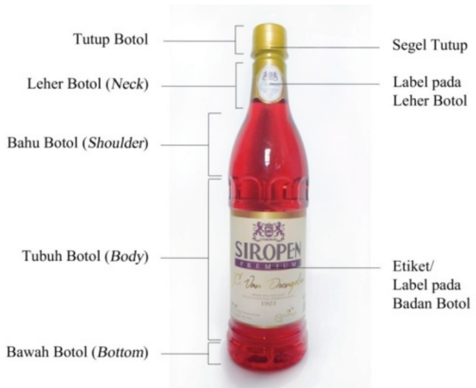
Figure 1: The Anatomy of Siropen Premium Bottle

Siropen Premium is packaged in a 700 ml bottle in size. The bottles are high in shape with slim body shape and straight side. At the top of the body, there are bow-shaped ornaments and the bottom of the bottle body also has a screw-shaped ornament. The bottle shoulder ramps. The bottle neck has narrow diameter and long.