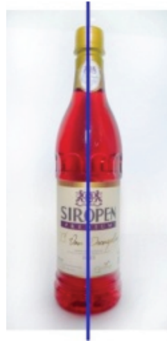
Figure 8: Symmetrical Balance in Siropen Premium Packaging

However, the symmetry is appropriate for the classic design style. One of the main features of Victorian graphic design is the composition that tends to be evenly and symmetrical (static).