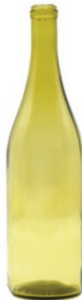
Figure 10: Burgundy Bottle

The bottle of Siropen has a structure similar to one of a type of wine bottle—Burgundy, with ornaments added. The characteristics of Burgundy bottles such as the classic and elegant shapes, has a sloping shoulder, and a slightly wider body of bottles than other parts. Wine bottles give a more premium impression. It can be a historical representation that once a syrup is a premium drink that can only be enjoyed by the Dutch nobles.