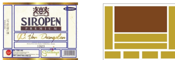
Figure 6: The Layout of Siropen Premium Packaging Label

Layouts on the packaging design can convey the impression and sharpen the delivered informations [5]. Layout settings on the packaging design should also pay attention to information hierarchy and order of importance. Packaging label Layout Premium Siropen is predominantly by text element, centered, symmetrical, and uses a modular grid. The use of symmetrical balance and center text create a classic impression according to the concept of packaging design strategy and aligned with the shape of packaging structure. Layout settings also correspond to the visual hierarchy starting from the most important text that is brand names that made to be the biggest. Then followed by the product name, then a tagline. Furthermore, other information/mandatories are placed at the bottom in the aligned small pannels. The composition is neatly set which included as jumble layout.