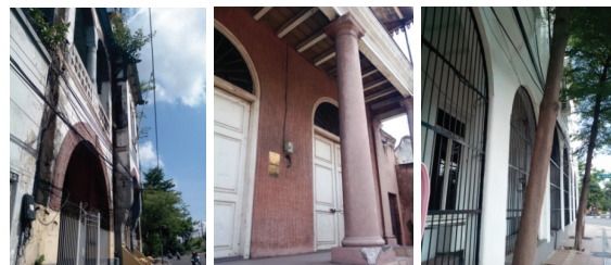
Figure 12: Construction of Stone Bows in Old Buildings in the City of Surabaya

The construction of the stone bows can also be found in the area of Dutch colonial buildings in Surabaya. Some of the buildings around the Siropen factory appear to have arc-shaped doors and windows. Siropen Factory is located in the Old City area in Surabaya.