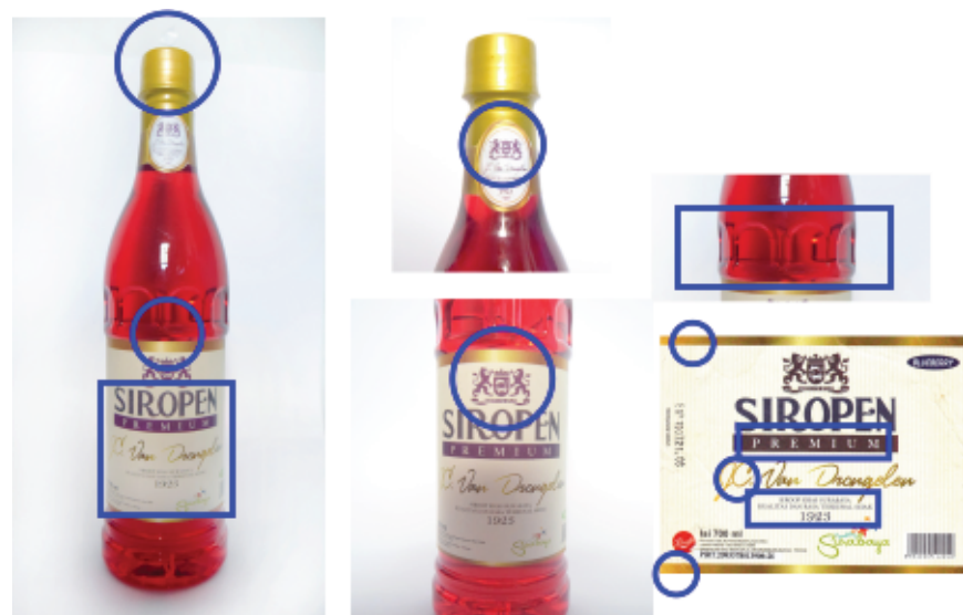
Figure 7: Visual Elements of Siropen Premium Packaging Design Affecting Unity

The Premium Siropen has a good unity caused by the similarities in color used namely gold and brown in the label on the body of the bottle with seals and labels on the neck of the bottle. In addition to repetition of the emblem and text elements, the repetition of shapes into ornaments on the body of the bottle, the similarities and typographical alignment, as well as the similarity of design styles used on labels that also align with the design of the bottle.