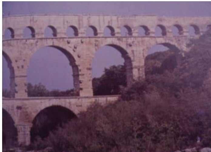
Figure 11: Stone Bows Construction

The construction of the stone bows can also be found in the area of Dutch colonial buildings in Surabaya. Some of the buildings around the Siropen factory appear to have arc-shaped doors and windows. Siropen Factory is located in the Old City area in Surabaya.