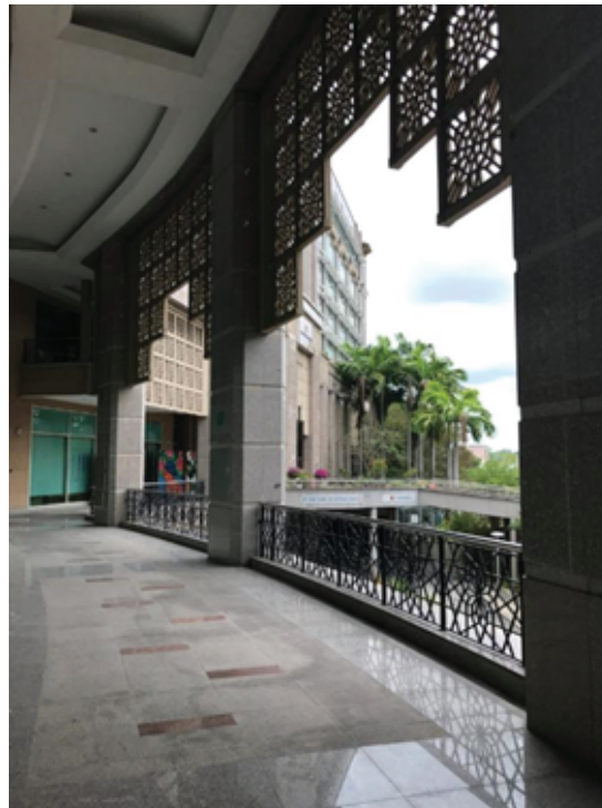
Figure 6: Covered walkways with usage of sun shading devices.

As such, the most important aspect in the architect’s point of view is that the building should firstly serve its intended function and purpose, and that translates into the function towards the end user. This was the most critical aspect that he tried to convey in the design of the building.