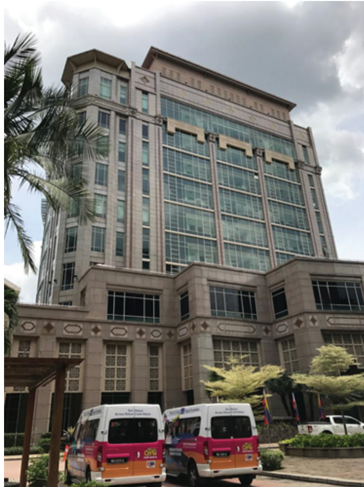
Figure 2: Exterior characteristics and generous landscaping (Source: Kanesh, K., 2017. Exterior view. [Unpublished photograph]).

heavily expressed as a tropical feature. Numerous characteristics found in this building are reinterpretations that are similarly found in other notable works by the architect in charge, such as the Putra Mosque and Dataran Putra. These are distinct features of the building that expressed its character.