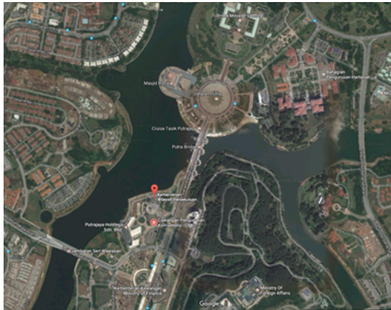
Figure 1: Location plan of Menara Seri Wilayah.

Sdn. Bhd Complex. Jabatan Perancangan Bandar, Perbadanan Putrajaya, Putrajaya). The building was designed as an intelligent building that boasts an array of state of the art technological advancements during its time of construction, and at the same time commanding lake views with green landscapes. Some of the features that can be observed are the notable exterior finished with colored granite, raised floors, and generous landscaped gardens (Figure 3).