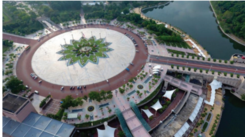
Figure 8: Dataran Putra by Kumpulan Senireka Sdn. Bhd. (Source: Rahman, H., 2016. Dataran Putra Putrajaya. [ http://www.harisrahman.com/my-blog/2016/10/13/more-exploration.html ])

As he further reflected, he is proud of the works that he and the firm collectively contributed, such as the Dataran Putra which have become a favorite tourist attraction, as well as some of the surrounding buildings that were also works of Kumpulan Senireka (Figure 8). By adhering to the design principles, it is unlike some of the more modern buildings that is cold and uninviting, which is uncharacteristic of Malaysia. While some architects may like them, it is rather familiar and can exist and be found in any other capital cities of Asia. In that case, it does not give it a distinct character that relates to Malaysia.