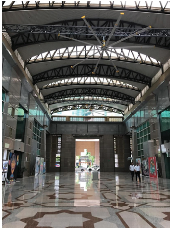
Figure 3: Large central atrium space.

interview was conducted with Ar. Abu Hanapiah via email correspondence to obtain his views of the issue of research.