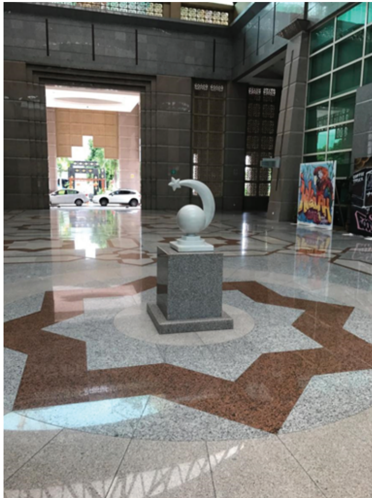
Figure 5: Islamic characteristics found in Menara Seri Wilayah.

national petroleum company with 64.4% equity; Khazanah Nasional Bhd, the investment arm of the Malaysian government with 15.6% equity; and Syarikat Nominee Bumiputra Pte Ltd, with 20% equity (Cheah, S. (2003). Special features of Menara PjH. The Star. [online] Available at: http://www.thestar.com.my/business/business-news/2003/09/29/special-features-of-menara-pjh/ [Accessed 15 Mar. 2017]). The architect reflected on the role and relation of the client's brief and how it relates to the governments plans: