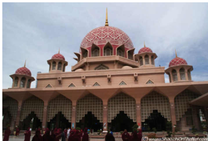
Figure 7: Putra Mosque by Kumpulan Senireka Sdn. Bhd. with similar Islamic characteristics

to this building were mainly Islamic features. They can be seen in other notable works surrounding Putrajaya, some from the same architect firm in charge such as Dataran Putra, Putra Bridge as well as the Putra Mosque (Figure 7). To an extent, these features can also correlate to the building of Ministry of Finance, giving it a regional identity (Mohd Ali, A. H. (2017). Idea of a national architectural identity). Those features that was worked on gave the area and subsequent buildings that emerged, its own character. This cluster of buildings at the start of the conception of Putrajaya, work together to give it a distinct character that differs to those that are seen in more recent times.