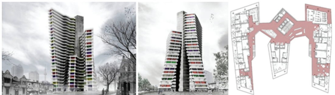
Figure 1: New Shanghai Habitat – renders and plan showing (re)interpretation of Lilong streets.

vectors capable of sustaining communal life in the vertical dimension. Through the integration of pocket spaces within these transitional spaces, the tower balances the ratio of interior and exterior spaces to generate encounters as well as hosting diverse communal activities. By fostering and nurturing social bonds among its inhabitants, the New Shanghai Habitat proposes to create a variant of the vibrant street life found in and around the Lilong settlements.