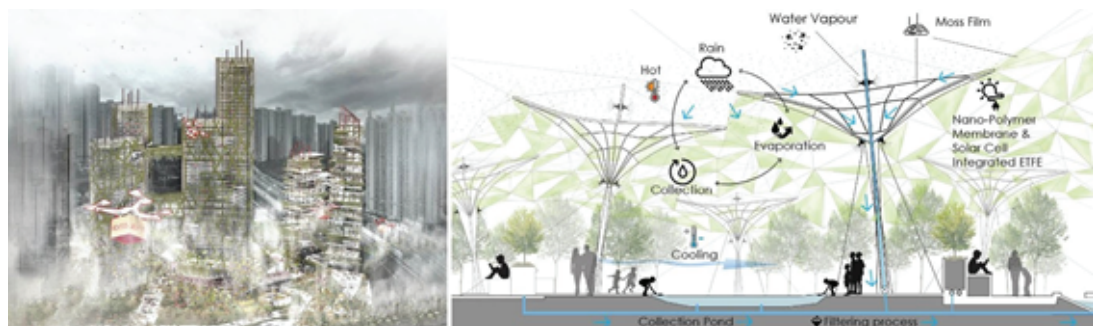
Figure 2: Networking Tradition and Future – renders and section through tensile membrane network.

Beyond employing various approaches to address ecological sustainability, the Networking Tradition and Future project seeks to inform and sensitise its inhabitants to the consequences of their actions on the environment. With environmental challenges