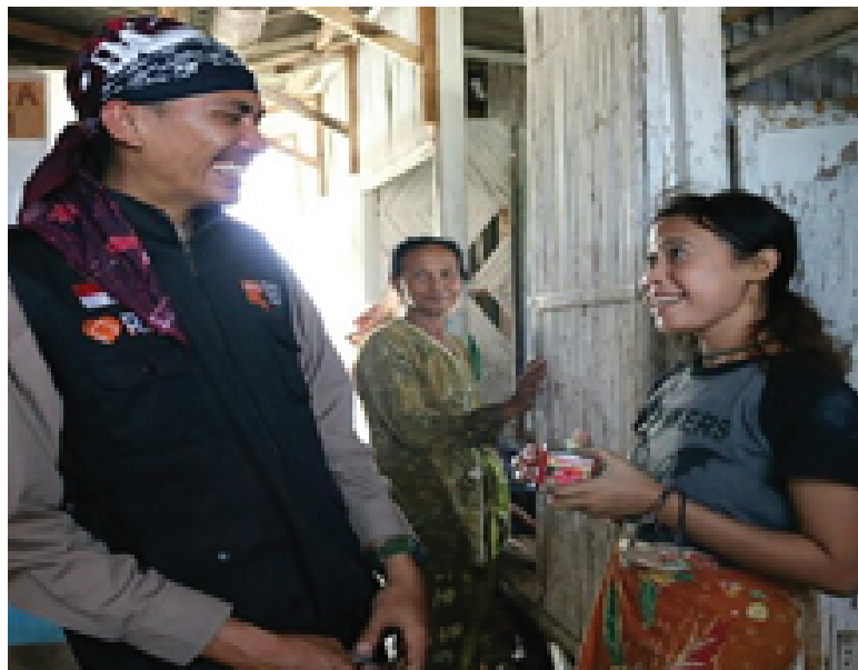
Figure 8: Role of Volunteers.

Preventive efforts prior to repressive efforts in dealing with environmental issues are needed with careful planning with inter-agency coordination such as the Central Government and Local Government. In addition, community participation also plays an important role in minimizing criminal (crimes) in the field of environment, such as pollution, logging, destruction of nature and so on