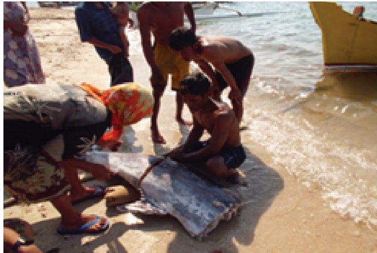
Figure 2: Fishermen's Activities.