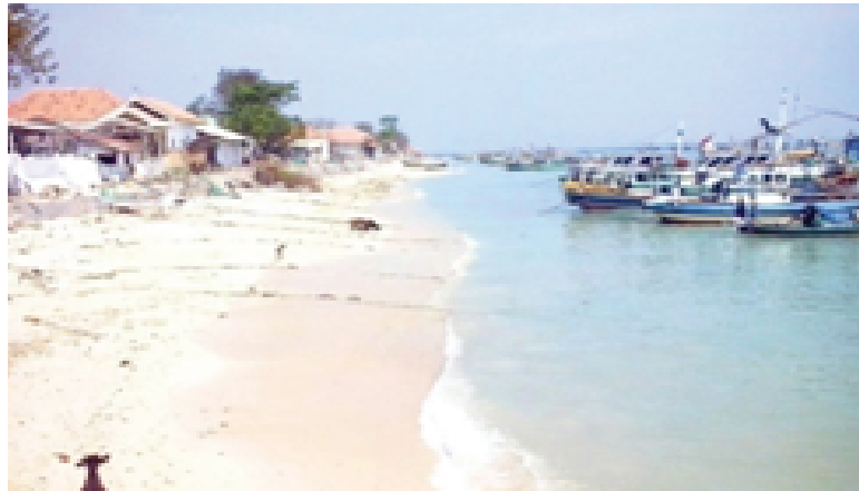
Figure 1: Map of Gili Ketapang Island Probolinggo regency.