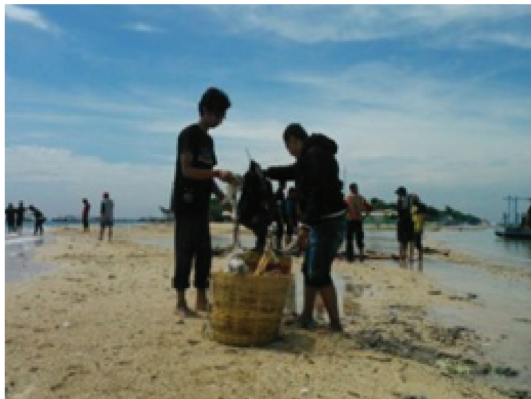
Figure 5: Waste Collection.

In order to apply the concept of Sound Material-Cycle Society dibutuhkan community participation through the concern and involvement of the community physically or non-physically, directly or indirectly, on the basis of self-awareness or as a result of the role of guidance in the management of coastal areas of Gili Ketapang. Below is picture 5 and 6 showing a form of awareness shown by community in coastal area of Gili Ketapang island: