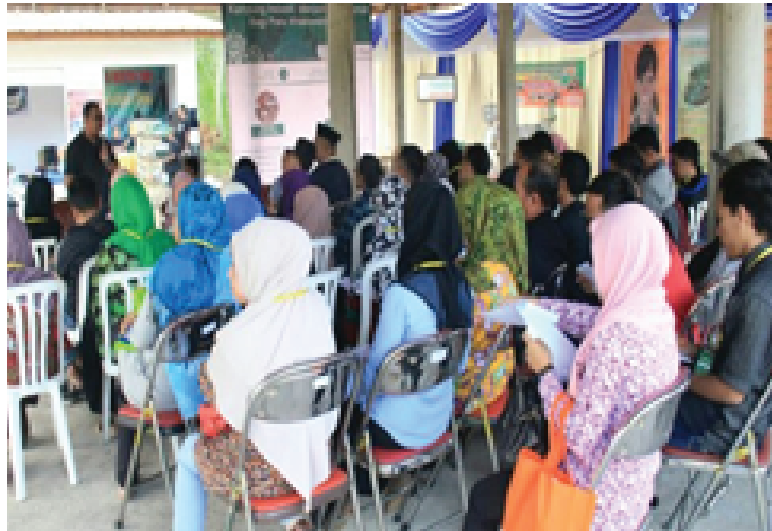
Figure 7: Socialization from the Government.