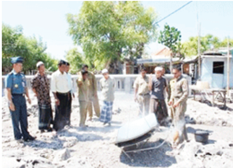
Figure 6: Development of Solar energy.

As a comparison, in Japan dividing the responsibility to the stakeholders on the waste management, especially solid waste, which always increase volume every day in the coastal area of Gili Ketapang Island, the role of each stakeholder, among others: