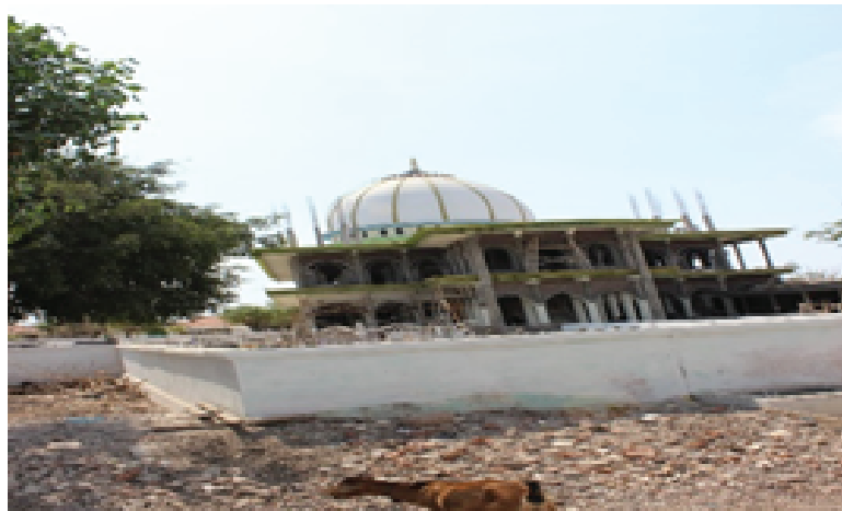
Figure 3: Neighborhood around the mosque.

Based on the Regulation of the Minister of Marine Affairs and Fisheries of the Republic of Indonesia Number 40 / Permen-Kp / 2014 on the role and empowerment of communities in the management of coastal areas and small islands of coastal and small island management or called PWP-3-K it is necessary to coordinate the planning, utilization, and control of coastal and small island-island resources undertaken by the Government and Government of the Region, between sectors, between terrestrial and marine ecosystems, and between science and management to improve people's welfare.