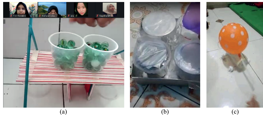
Figure 2: STEM teaching simulations and its engineering challenges (a) constructing straw bridge (b) finding the best insulator, (c) making air powered car.

The third week's activities consist of lecturing about the nature of science and mathematics, the goals of learning science and mathematics, and how STEM-based lessons can help elementary students to achieve those goals. Prior to the lecturing, the pre-service teachers were given a video showing examples of STEM lessons in elementary school and were asked to identify characteristics of STEM lessons. To let the pre-service teachers have the idea of how students can learn science and mathematics through STEM lessons, they were given the "Tallest Paper Tower" challenge that they must solve collaboratively with their groups, as seen in Fig. 1(a) and Fig. 1(b). Through this challenge, pre-service teachers need to construct a stable tower as tall as possible using only six A4 paper and one-meter tape. The tower should withstand self-weight and lateral wind load coming from the surrounding. At the end of the session, they need to present their tower, measure it using a measuring tape and explain possible science and mathematics topics associated with the challenge. Some topics identified by students include geometry, properties of matter, force, measurements, etc.