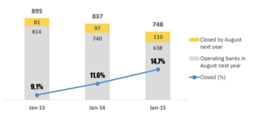
Figure 2: The number of bank in annual cross-sections.

The construction of binary selection models based on 2013 data was carried out using the statistical analysis medium R. Since the number of banks closed for the year is much less than the total number of banks, stratified samples with an increased number of closed banks were formed during the construction of the model. On the basis of each formed stratified sample, a logit model was constructed, with the help of which a calculation of the predicted values was made for the full data of each of the annual cross-sections considered.