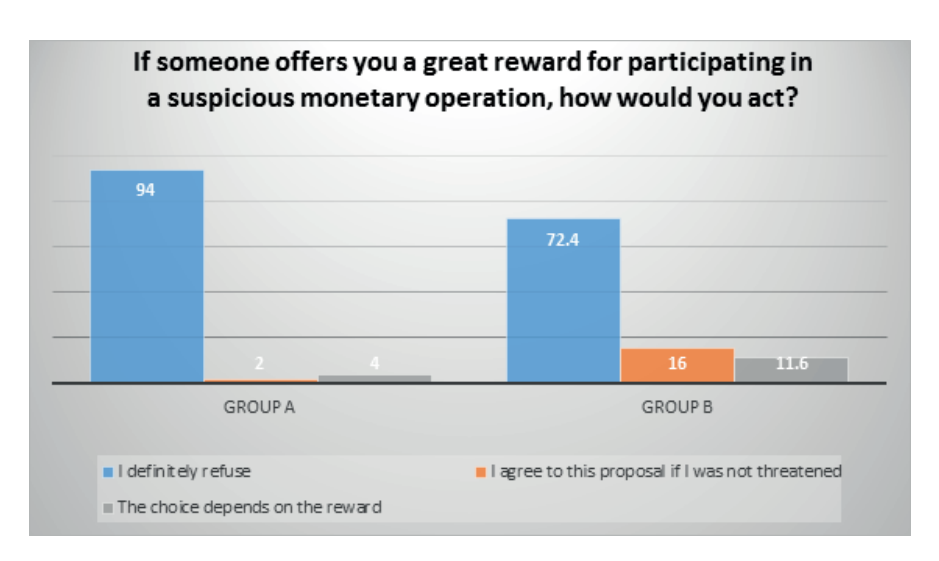
Diagram 3: About the attitude to money laundering.

video or commentary, remaining unrecognized. Video (from March 2017) related to the corruption investigation, has a record number of viewing - 25 million. That is, if the population of Russia is about 146, 5 million people [6], we can say that approximately every fifth person in Russia watched this video. For comparison, according to the results of the CEC (CEC - Central Election Commission), 47.8% of the population (about 70 million people) participated in the State Duma elections in 2016 [7]. This fact indicates that the citizens are interested in fighting corruption, and therefore they are interested in raising their awareness in this sphere.