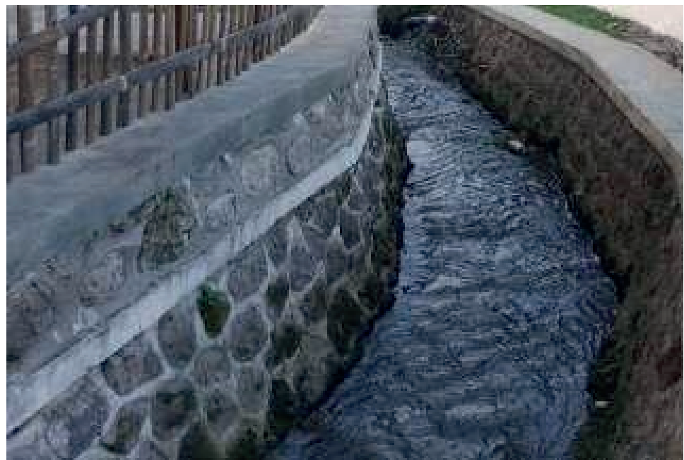
Figure 2: Heavy Water Flow in the Al Munawar Islamic Boarding School.

The process of identifying the potential of pesantren is divided into two parts, natural potential and human potential. One of the natural potentials possessed by the Alkautsar Islamic Boarding School is that there is a river with a heavy flow of water. the river is right in front of the Islamic boarding school, as seen in Figure 2.