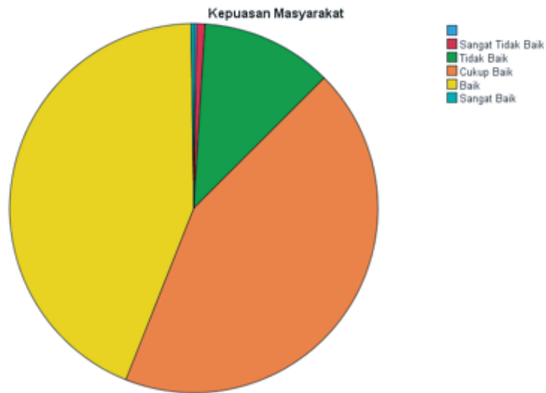
Figure 2: Recapitulation of The Community's satisfaction to infrastructure development.