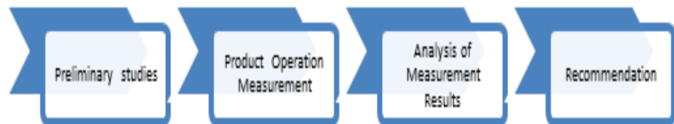
Figure 1: Research Methods.

The theory and literature study related to the research of McCall's method to measure the quality of software from the Operation Product factor as presented in Fig 1.