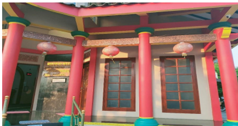
Figure 9: Red color on the pillars of the mosque.