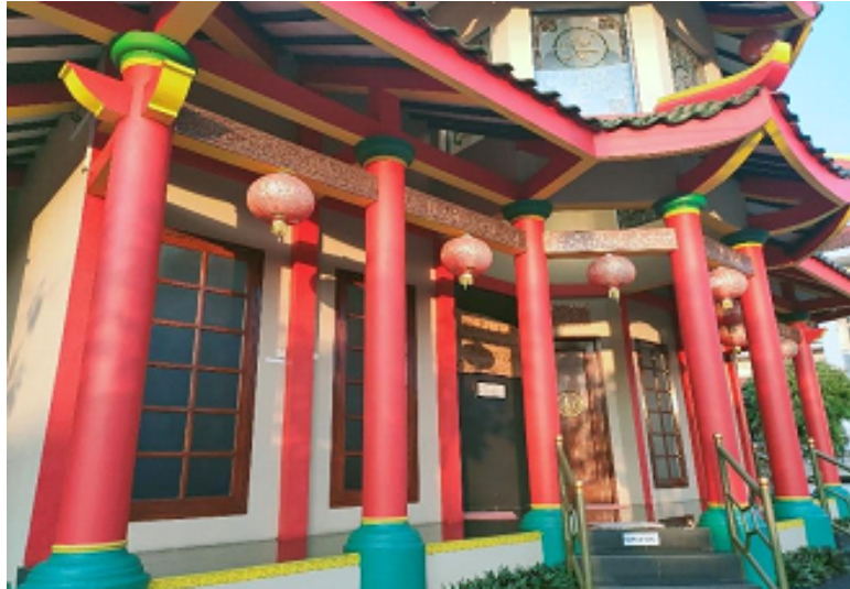
Figure 3: Pillars of the Mosque.