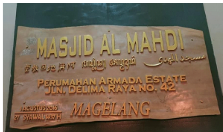
Figure 16: Al Mahdi Mosque Nameplate.

The nameplate of the mosque describes a building with the name Masjid Al Mahdi by displaying four languages. 'Masjid Al Mahdi' indicates the use of Indonesian because it is located in Indonesia. Javanese script is shown because the mosque is located in Magelang, Central Java. The Chinese script is indicated because of the mixing of