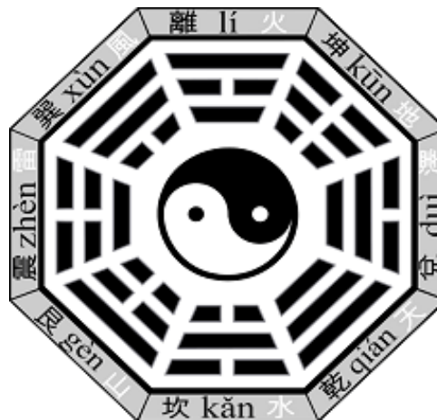
Figure 15: Patkua Diagram (Bāguà ☰).

are water, earth, fire, earth, heaven, gung, swamp, and thunder. Then in the middle is the symbol of Yin and Yang, the center of all sides. In addition, Patkua (☰ Bāguà) in history was used to determine the layout of buildings and the cardinal points known as fengsui.