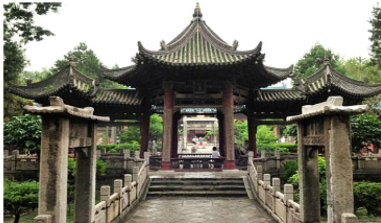
Figure 8: The shape of the roof of the entrance of the Great Mosque of Xi'an .