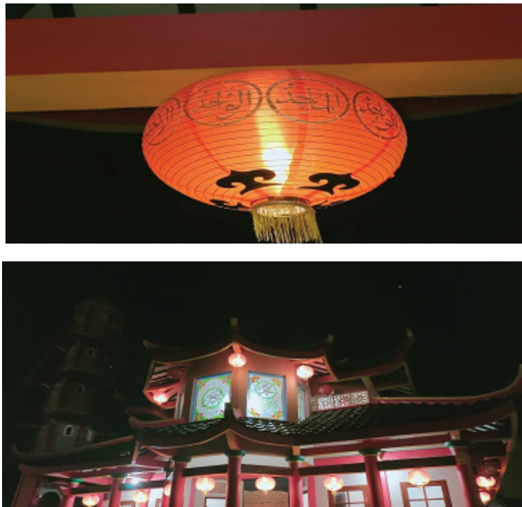
Figure 17: Writing of Praise in Arabic on Lanterns.

The philosophy of placing the good names of Allah on the lanterns, and placing the lanterns on the outside of the mosque is because every human being who has made various mistakes will always be opened for forgiveness in which Allah's good qualities are radiated by the light of the lantern.