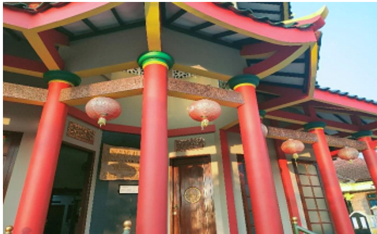
Figure 1: Lanterns on the Terrace of the Mosque.