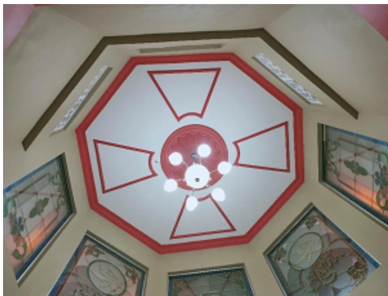
Figure 14: The shape of the octagonal mosque roof. Source: personal documents.

Source: wiki.com In cosmogony philosophy in China, (卦 Bāguà) is an eight-sided figure that is of equal size and rests on a single point in the middle. The eight sides