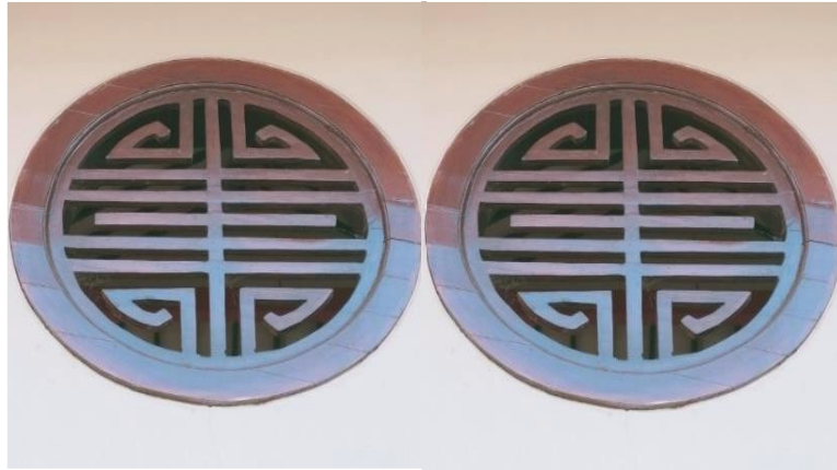
Figure 13: Mosque Round Window.

The Al-Mahdi mosque building has air ventilation in the form of windows that are not too big. The shape of the size contained in the window also can not be ignored. When observed, the shape of the window carving resembles the letter (风 fēng) which means wealth, success, achievement. The use of carved patterns on small windows found in mosques signifies that no matter how small or big the achievement, success, wealth that is owned and obtained, humans must always be grateful and always remember Allah.