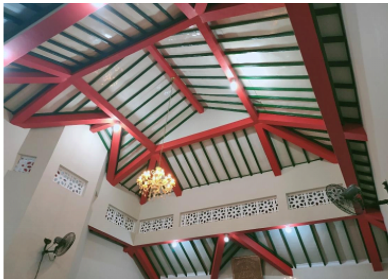
Figure 10: White Color in the Mosque Sky.

In Indonesian culture, white is a color that symbolizes purity, cleanliness, but it is different from China. The color white in Chinese philosophy means sorrow and destruction.