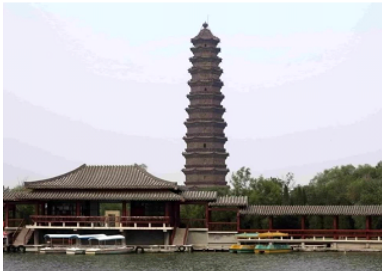
Figure 6: Tower in Kaifeng city, Henan.

The philosophy of the formation of a cone building or the taller the building the smaller it is so that the adherents of the teachings as their knowledge increases, the more they focus on their god which is shown from the pointed end of the tower. Similar to mosques for Muslim worship, the tower is formed to sound the call to prayer so that every worshiper who hears it will immediately come to the mosque to perform worship