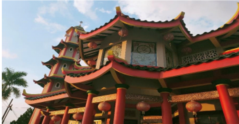
Figure 5: Mosque Tower.