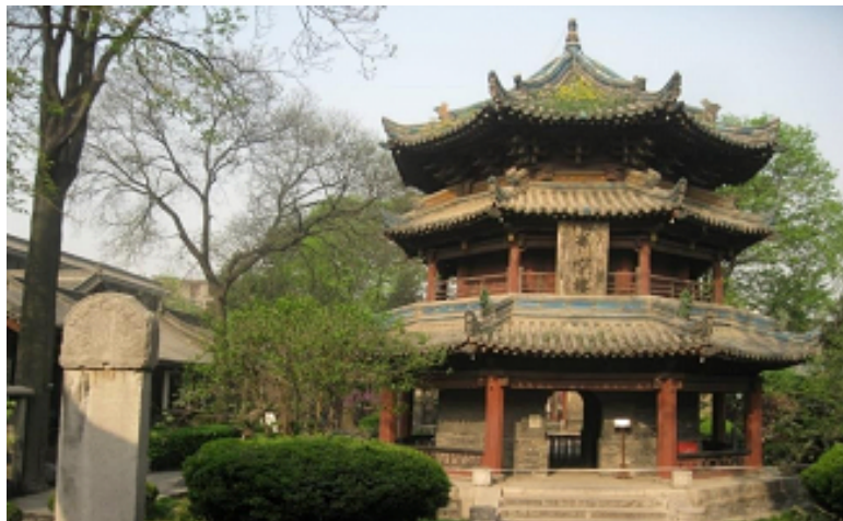
Figure 4: Pillars of the Great Mosque of Xi'an.

Chinese culture, the number eight (八 bā) is considered to have a very deep meaning, which is to bring good luck and prosperity. In Romans, the number 8 also has its own meaning, namely infinity which means infinite. With the intention of luck and prosperity will continue to come without stopping to every congregation of the mosque.