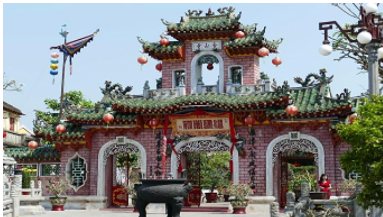
Figure 2: Lanterns at Vietnam Pagoda Temple Entrance.

used to be used for lighting, as well as hanging in front of houses. The philosophy of placing lanterns on the terrace of the house is considered to bring peace or a sense of security and luck or bring sustenance. On the outside of the lantern there is usually calligraphy that says positive things that are expected to have a good impact on everyone who enters the building. Similar to the Al-Mahdi mosque, placing a lantern on each side of the mosque terrace will provide a sense of security when worshiping and bring good things when leaving the mosque.