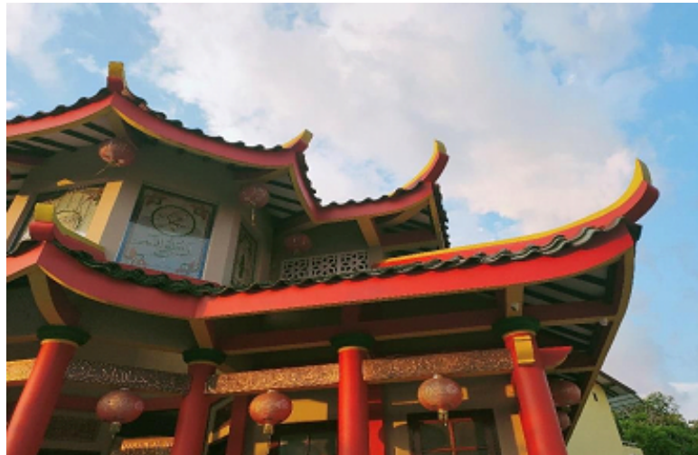
Figure 7: The shape of the roof of the mosque.