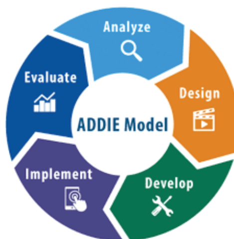
Figure 1: ADDIE Model [8].

This type of research is research and development. The population in this study were postgraduate students of educational management programme Universitas PGRI Semarang. Data collection techniques used are tests validation expert judgment, questionnaires and documentation. The material in this learning media is human resource management courses education. Data analysis techniques in this study were analysis questionare. The development model used is the ADDIE model which includes analysis, design, development, implementation, and evaluation. The ADDIE model can be shown in Figure 1.