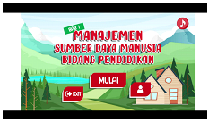
Figure 2: Design of AR-based mobile educations for HR management after revision.

In making augmented reality-based mobile education products, the material for ordinary differential equations has been made in a team by the Universitas PGRI Semarang research team and assisted by IT experts outside Universitas PGRI Semarang so that there is good collaboration with the Universitas PGRI Semarang research team to create a material framework and design that is expected in making ordinary differential equations based on MR, then executed by IT experts who are competent in their fields, after the design of the MR-based mobile education is approximately 3 months according to expert judgment advice, the product is continued in the third stage, namely development.