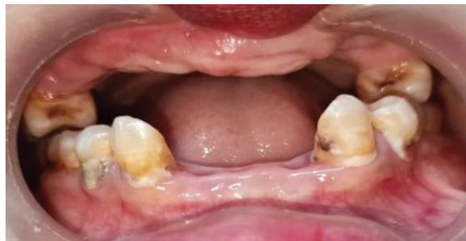
Figure 11: Mucosa healing one month post-insertion.