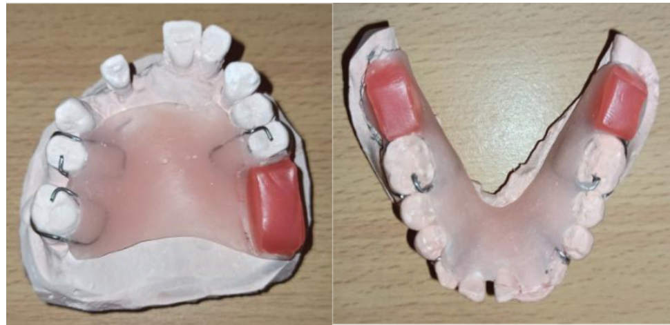
Figure 4: Temporary baseplate with bite record to record centric occlusion.