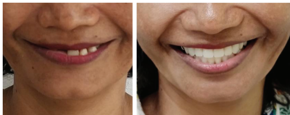
Figure 12: Comparations of patient smile before (a) and after (b) immediate denture treatment.

site was examined. Debris was cleaned using saline solutions irrigations. Healing was good and there were no sign of bleeding. The fitting surface was checked for any traumatic contact using pressure indicating paste (PIP ( fig.10 )). Occlusion was checked and adjustment was made. Patient re-evaluated one week and one month later.