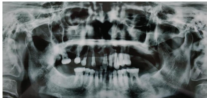
Figure 2: Panoramic radiographic examinations of the patient.

Informed consent was signed before treatment. The procedures consist of six clinical appointment which took two months in total. Treatment was started with impression taking, facial and dental analysis, centric relations registrations, tooth extractions and immediate denture insertions. Post-insertions recall were one day, one week and one month after denture insertions.