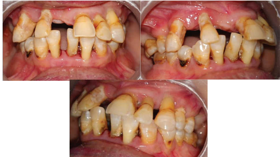
Figure 1: Initial conditions of the patient teeth and occlusions. Anterior view (a), lateral right (b) and left (c).

The treatment plan were extractions of maxilla and mandibula hopeless teeth (13, 12, 21, 22, 23, 24, 32, 31, 42) and replacement with acrylic resins conventional immediate partial dentures.