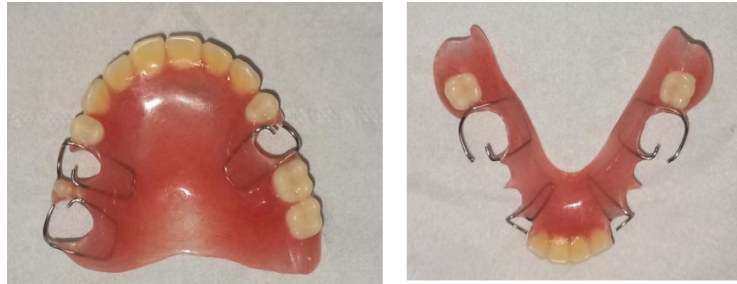
Figure 7: Maxilla and mandibula immediate denture.