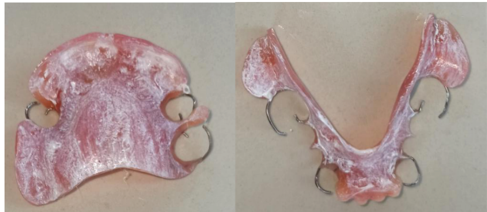
Figure 10: Pressure indicating paste on the denture fitting surface indicate any excessive mucosa impingement to the mucosa.