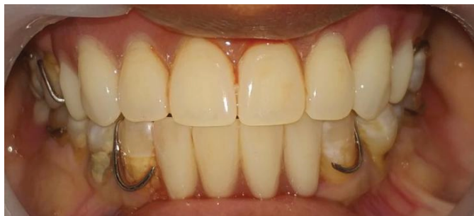
Figure 9: Immediate denture insertions.

Before insertions, the denture was prepared by cleaning it with soap and water, and immersed in 0,05% chlorhexidine solutions for one hour. Tooth extractions procedures was started by wiping the surgical area with povidone iodine solutions. Extractions was done with local anesthesia (Pehacain ® ) in the vestibulum area ( fig. 8 ). After tooth was extracted, surgical site bleeding was controlled by pressing with wet sterile gauze for a while and denture was immediately inserted ( fig.9 ). Retention, stabilization and occlusion was checked and adjusted. Patient was given antibiotics (amoxicillin 500 mg) three times a day for five days and NSAID (mefenamic acid 500 mg) to be consumed only if pain was felt. Patient was instructed not to remove the denture 24 hours following insertions, avoid hard and hot foods, performing oral hygiene.