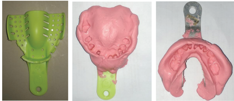
Figure 3: Modifications of maxillary tray (a); Impression taking using hydrocolloid irreversible materials (b and c).

undercuts was blocked-out with flowable composite and impressions was poured twice to make diagnostic and working cast.