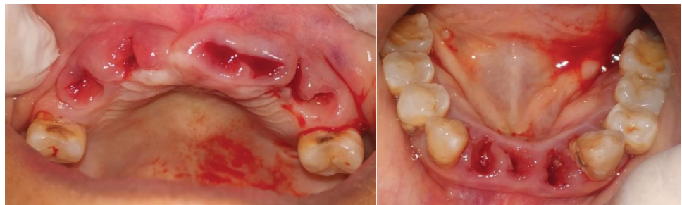
Figure 8: Maxilla (a) and mandibula (b) teeth extractions.