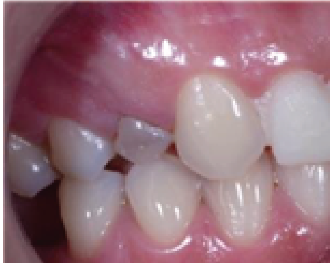
Figure 3: Clinical appearance of tooth 14.

for oral hygiene and given informed consent at the time of surgery. Tooth 14 performed gingivectomy by 2 mm then osteotomy by 2 mm. Preparation is done 10 weeks after crown lengthening and crown insertion after 12 weeks after crown lengthening.