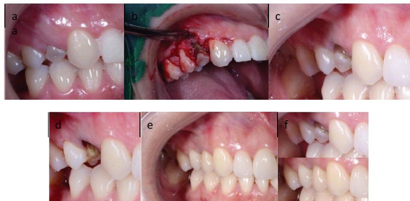
Figure 4: a. Clinical appearance 14; b. Crown lengthening and osteotomy; c. control 3 weeks after crown lengthening and osteotomy; d. After crown preparation; e. After crown insertion; f. Before-after appearance.

for oral hygiene and given informed consent at the time of surgery. Tooth 14 performed gingivectomy by 2 mm then osteotomy by 2 mm. Preparation is done 10 weeks after crown lengthening and crown insertion after 12 weeks after crown lengthening.