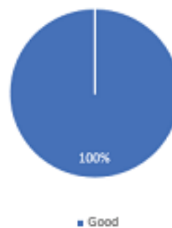
Figure 5: Category of respondent's knowledge at post-test.

mean there was an effect between education of cough self-medication using slide media and the knowledge of the Luhur Islamic Boarding School Malang City students.