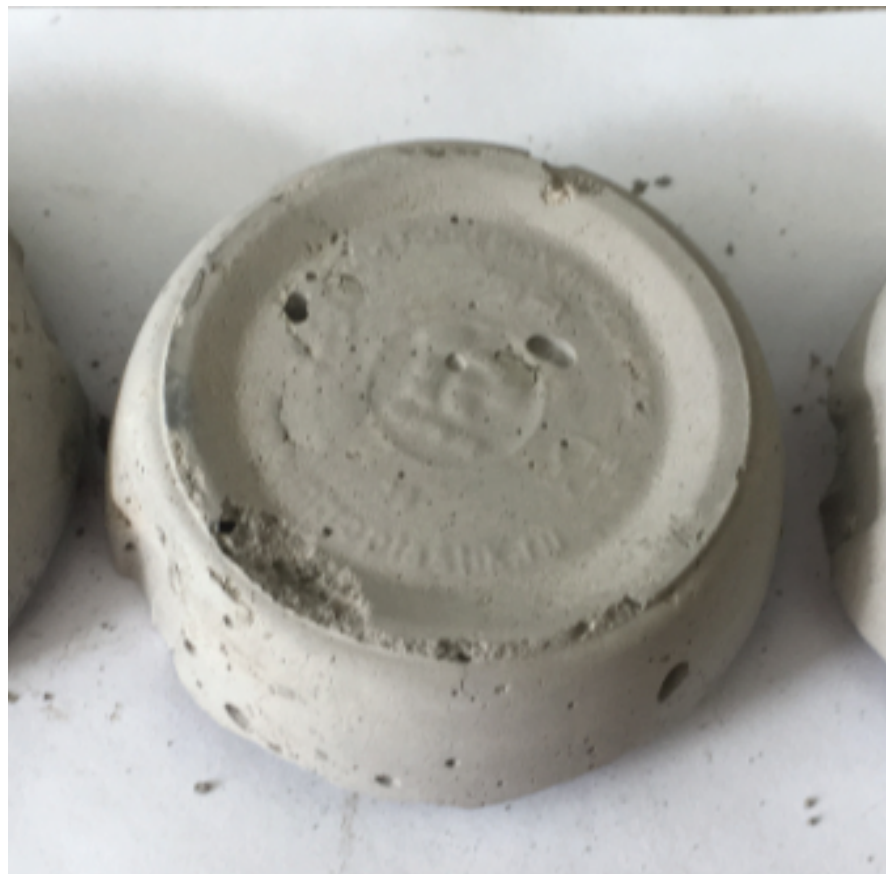
Figure 2: Appearance of the obtained sample after aging for five days