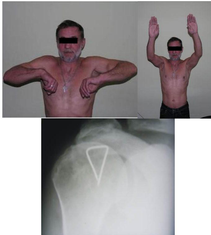
Fig. 4. Patient P., 51 years after 1 year after the operation, the amount of movement in the joint is full, a good result. At the head of the humerus (radiographically determined bracket of nickelid titanium)

Clinical example. Patient P., 51 years old, enrolled at clinic of traumatology and orthopedics with unoperative tendon ruptures of the rotator cuff. Was carried stabilizing operation with the use of the mesh implant, tenotomy and tenodesis tendon of the long head of these biceps with extramedullary fixation bracket of nickelid titanium. He was examined after one year (Figure 4), a good result.