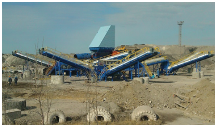
Figure 2: A view of the crushing and screening plant for smelter slag recycling on Severstal United Works

Cherepovets Metallurgical United Works Severstal cooperates with Finnish enterprises – producers of crushing and screening equipment. In 2014, a new crushing and screening plant (CSP) for slag recycling was commissioned in the united works. Supply of the basic process equipment for the project, erection supervision works and personnel training were performed by Ecofer Investment Oy (Finland). The amount of slag recycling on the installation exceeds 2.0 million tons per year. The CSP allows to produce construction break-stone of various fractions (0–5 mm, 5–20 mm and 20–40 mm) with the metallized particles content not over 5 %, that is, with improved physico-mechanical properties (Fig. 2) [4].