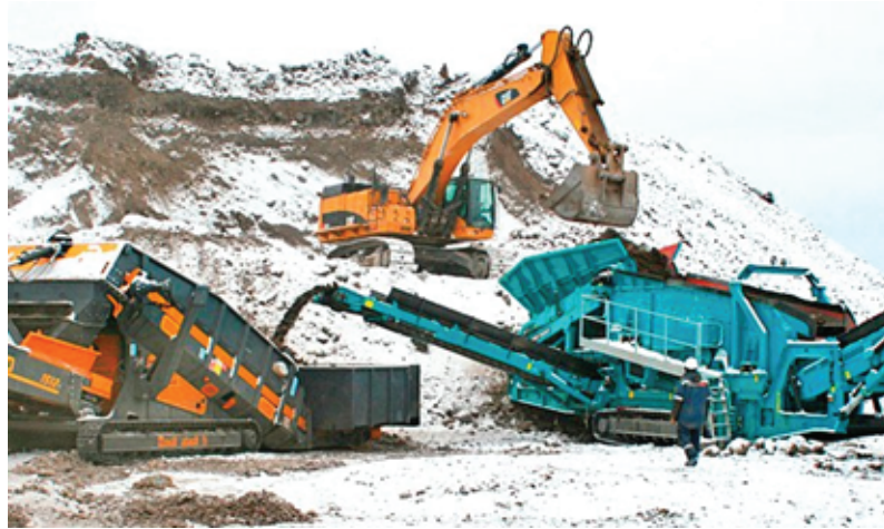
Figure 3: The crushing and screening plant for recycling of dump pile slags of Beloretsky Metallurgical Plant

AMZ-Tekhnogen Company utilizes packaged sets made by SANDVIK for recycling of dump pile slags. Such packaged sets are operated on Revda Metalware-Metallurgical Plant, Pervouralsk pipe plant and Kuznetsk Metallurgical United Works (Fig. 4).