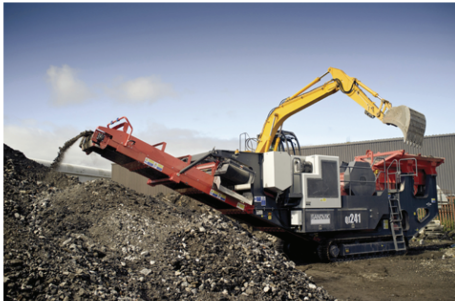
Figure 4: Self-moving packaged set SANDVIK

AMZ-Tekhnogen Company utilizes packaged sets made by SANDVIK for recycling of dump pile slags. Such packaged sets are operated on Revda Metalware-Metallurgical Plant, Pervouralsk pipe plant and Kuznetsk Metallurgical United Works (Fig. 4).