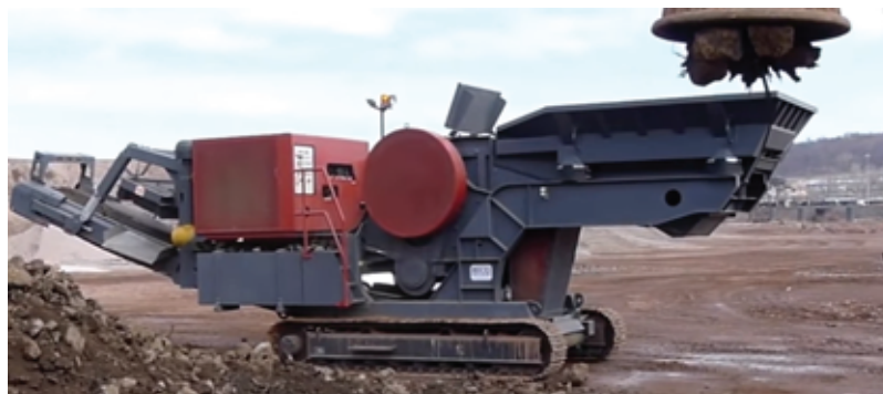
Figure 6: Installation for cleaning of slaggy scrap

Taking into account elevated requirements to the metal product extracted from slags, the equipment stock for scrap cleaning has been expanded. Along with domestic-made drum tumblers and type impact crushers, German firm Standart offers special crushers which are able to accept slaggy scrap with coarseness to 700 mm and purge it from the slaggy component by means of a special drive of the crusher's movable jaws (Fig. 6). On the inner market, the equipment for slag recycling is presented by firm Ecoprom [7].