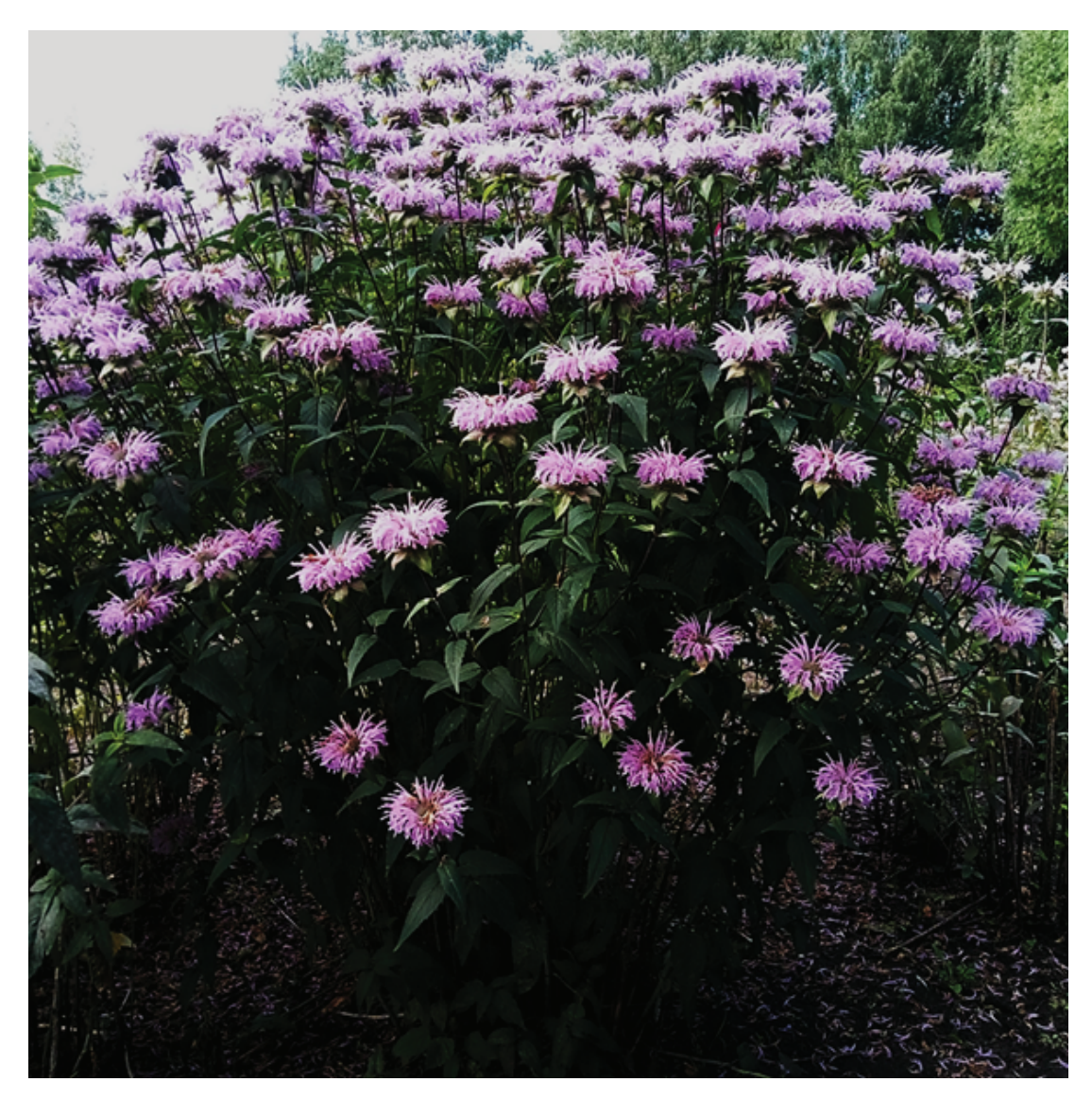
Figure 1: Blossoming phase of Monarda didyma L. in Western Siberia

TABLE 2: Evaluation of the promising outlook of the introduction of the species Monarda didyma L . in Western Siberia (according to the scale by Karpisonova, 1985)