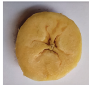
Figure 2: Cross section of agung banana after 11 days post-harvesting.