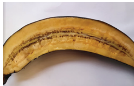
Figure 3: Longitudinal section of agung banana after 11 days post-harvesting.

Table 1 shows the physical changes post-harvest. On day 1 at harvest time, the colour of the bananas has not changed as in the tree (Figure 1). On days 3 to 11, the bananas showed a change in colour and texture. On the 11th day the banana stalks also darkened with a softer texture.