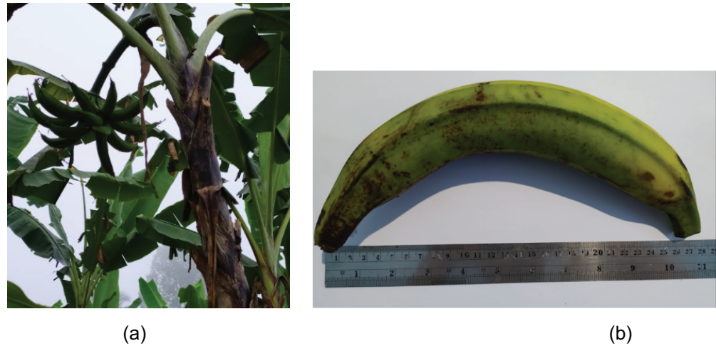
Figure 1: (a) The agung banana tree; (b) length of banana (post-harvest).