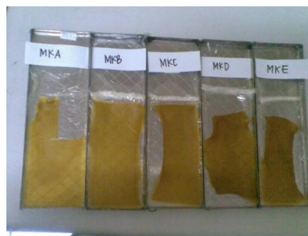
Picture 1. Fruit leather with the manggo puree and carrageenan composition

The fruit leather production that was conducted using the formulation as in table 3 can be seen in the Picture1 and Picture 2.