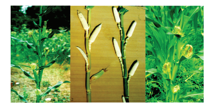
Figure 6: Examples of simultaneous (left) and non-simultaneous (right) blooming of ear and their results after ripening on a dissected stalk (center).

TABLE 1: Ear structure values of prolific maize with simultaneous and non-simultaneous blooming.