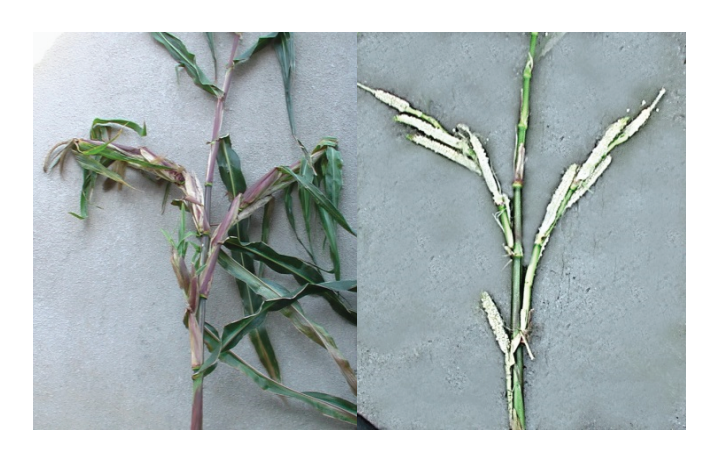
Figure 3: Branching of a 9-row ear plant of BC_2 progeny, maize to teosinte hybrid in its natural (left) and prepared (right) view.