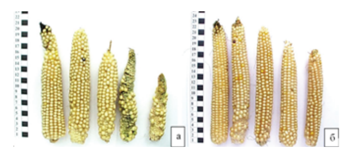
Figure 7: Grains/ear count of ears formed on the same plant with non-simultaneous (a) and simultaneous (b) blooming.

Ears that bloom on the 5th and subsequent days show significant drawbacks in qualitative indicators from the top ears, having smaller ear size, number of rows, number or seeds per row and grains/ear count (Table 1, Fig. 7). Besides, ripening of such ears also happens non-simultaneously, complicating their simultaneous harvesting and calibration.