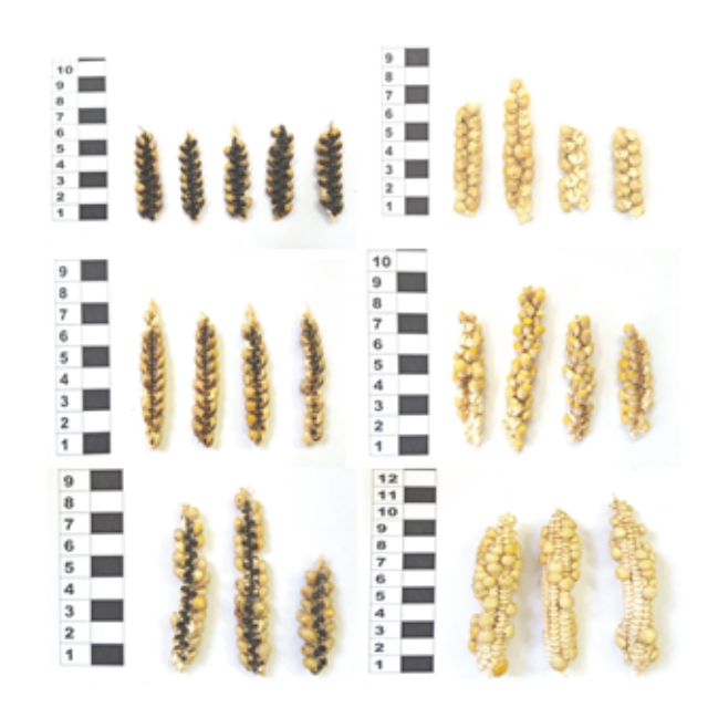
Figure 2: Spikes of the first back-cross BC1 (left side) and the second back-cross BC2 (right side) of maize onto teosinte hybrid.