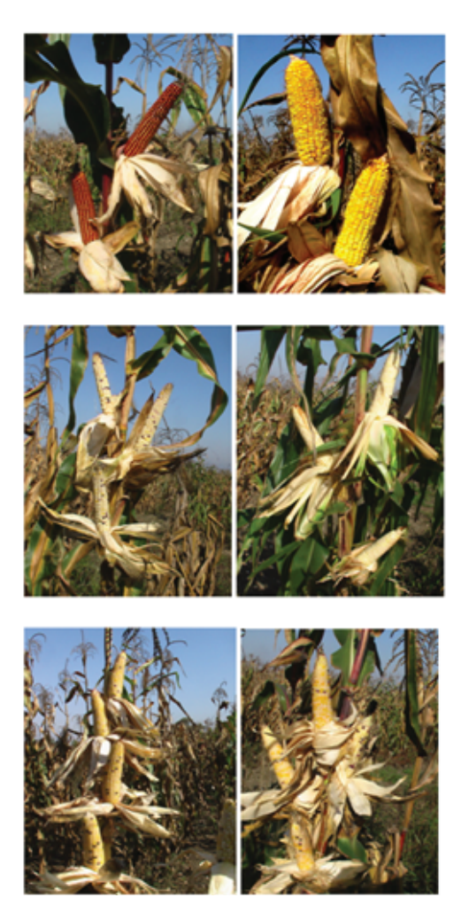
Figure 8: Hybrids of maize with simultaneous blooming of 2 ears (top), 3 ears (middle) and 4 ears (bottom).