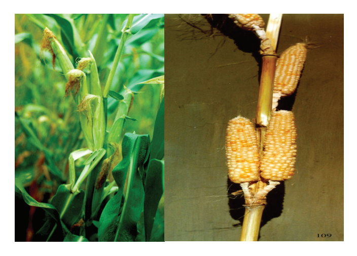
Figure 5: Development of double ear with separate cornhusks and a leg in a single joint.

grains/ear count. Structural differences between top and bottom ears are insignificant in the simultaneously blooming plants (Fig. 6).