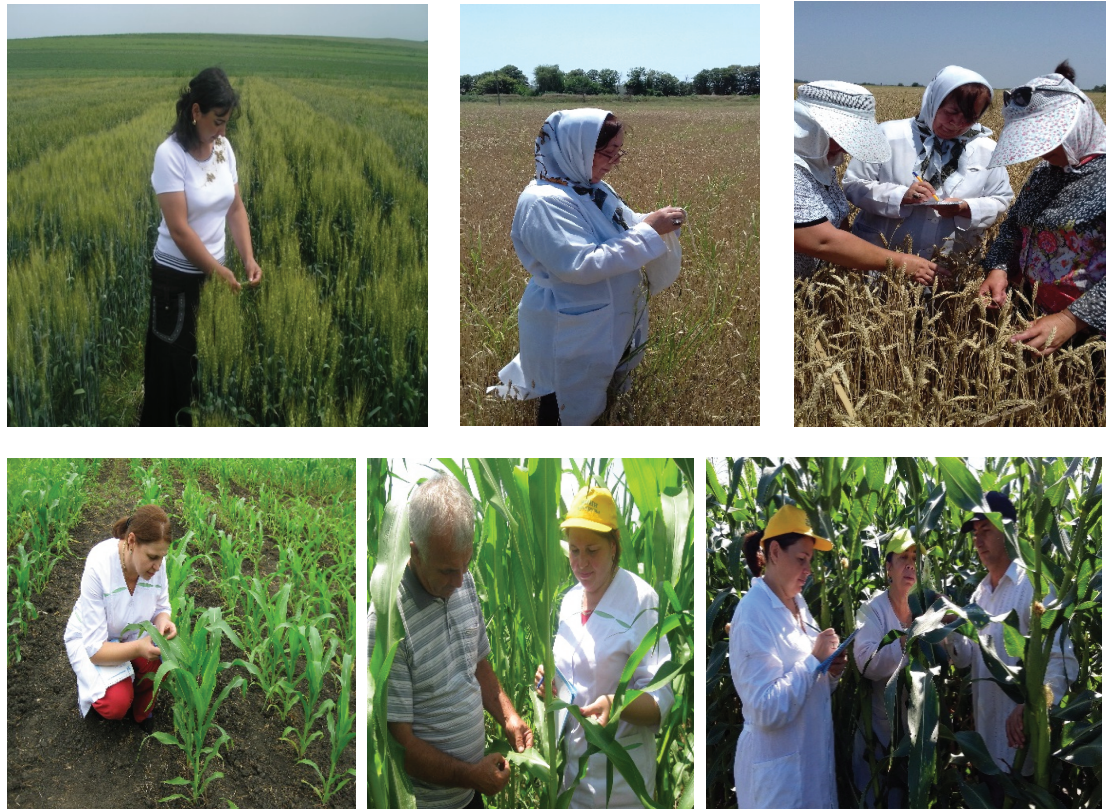
Figure 3: Monitoring of the condition of the winter wgeats.

In experimental corn areas, the first watering contributed to accumulation of pathogens of root and root rot of fungal and bacterial etiology. The subsequent watering had little effect on its development. During the growing period, decadal phytosanitary monitoring of pests was carried out; suspicious samples were identified in the laboratory conditions. The dependence of development of bubbly smut, mold fungi on the main predictors of weather and agrotechnical measures (watering, inter-row processing, etc.) was revealed.