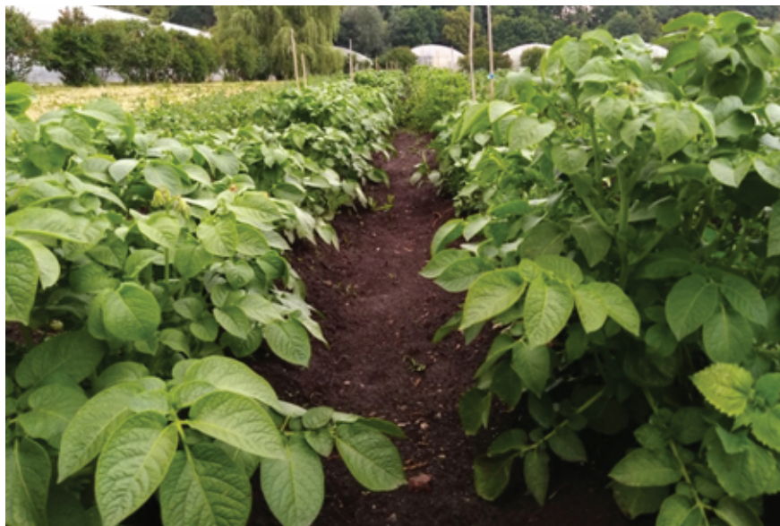
Figure 2: Options with watering (right) and without watering (left).

With the addition of glauconite containing trace elements, productivity increased by 16.0...29 %. The maximum increase in yield was observed with the introduction of glauconite in the norm of 20 g/rast., the minimum -- with the introduction of 30 g/rast. With an increase in the further norm, the yield decreases.