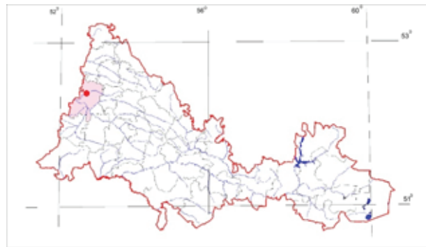
Figure 2: Iris aphylla distribution in Orenburg Oblast.

been reliably confirmed only in the protected area of the national park inside the forest (Fig. 2), in the area nearby subsoil use sites (ORIS). The major environmental resistance includes habitat destruction due to economic activity (including oil production, logging, etc.).