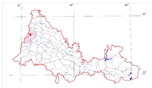
Figure 6: Salvia glutinosa distribution in Orenburg Oblast.

Current habitats are located in the Buzuluksky Bor National Park. It is necessary to monitor the status of the population through the identification of new habitats of a taxon for conservation; prohibition of economic activities in the habitats; organization of fire precaution.