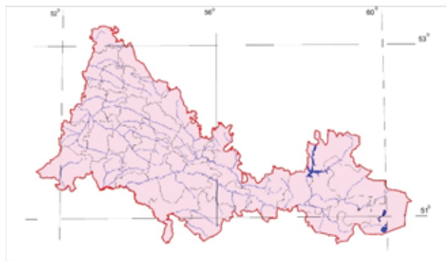
Figure 1: Stipa zalesskii distribution in Orenburg Oblast. Thereafter, the administrative divisions of Orenburg Oblast are marked pink.

To preserve the species from extinction, ploughing virgin steppes and old-age arable soil with Stipa zalesskii to grow should be banned as well as moving across the shrub-steppe areas off the permissible beaten paths. Monitoring the status of populations and possible cultivation in botanical gardens are recommended [15, 17].