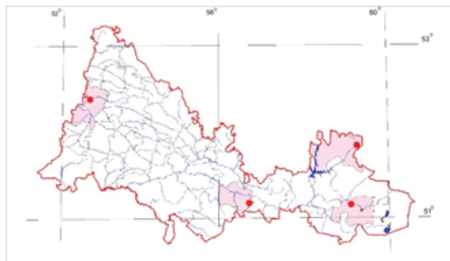
Figure 4: Pedicularis palustris distribution in Orenburg Oblast.

Saxifraga sibirica L. -- indexed 3 that implies a low number of individuals inhabiting a limited territory or sporadically distributed over an extensive territory. It is registered in the Red Book of Chelyabinsk Oblast (category 3 -- a rare species) [10].