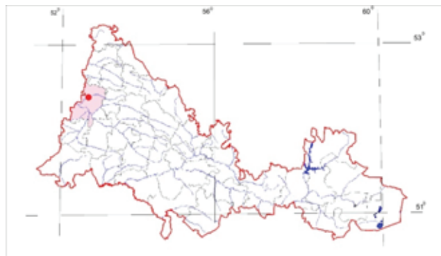
Figure 3: Botrychium lunaria distribution in Orenburg Oblast.

It is necessary to monitor the status of the population through the identification of new habitats of a taxon for conservation; prohibition of economic activities in the habitats; organization of fire precaution; elimination of the likelihood of any changes in the hydrological regime within the area.