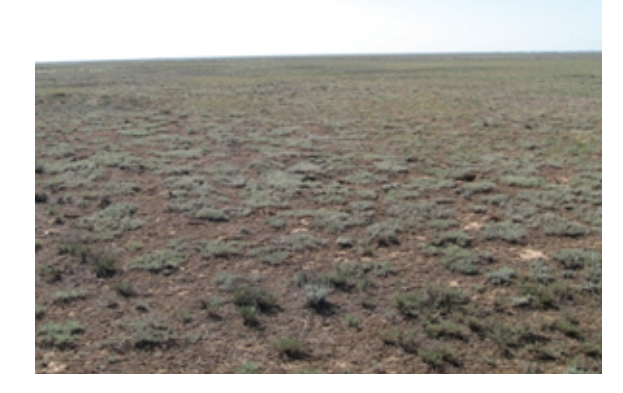
Figure 1: Semi-desert natural pasture (a control plot).

of sorghum: an increase in average air temperature by 1.1--3.7 °C compared to the longterm averages, in the daytime the temperature reached 45--50 °C, there no precipitation in May and June. The presence of productive moisture in the soil during the growing season was studied (Fig. 2).