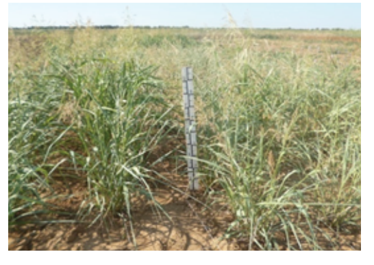
Figure 3: Perennial sorghum, Caravan, the ear emergence phase.

When studying sorghum yields, it was found that the most productive variety was Travinka with a standing density of 40 thousand plants per hectare -- 7.9 tons per hectare. Caravan with a standing density of 20 thousand plants per hectare had a yield of 3.9 tons per hectare. In comparison with the natural pasture (green mass yield is 0.44 tons per hectares, dry mass yield is 0.15 tons per hectares), sorghum yield is 18 times higher by green and 26 times by dry mass (the best options) (Fig. 3, Table 3).