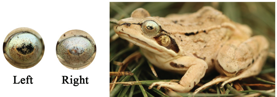
Figure 1: The hyperxanthism of the eyes in Rana arvalis is a new type of anomalies among amphibians.