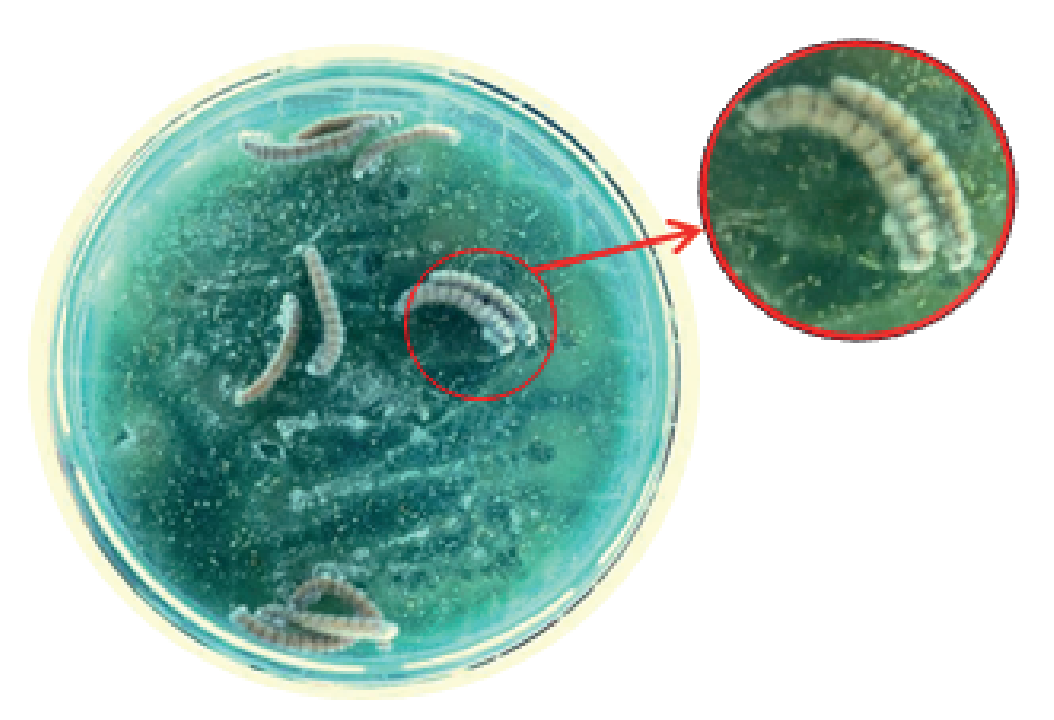
Figure 2: Fungal infection of samples of fungi isolates K.1 to Tenebrio molitor larvae.