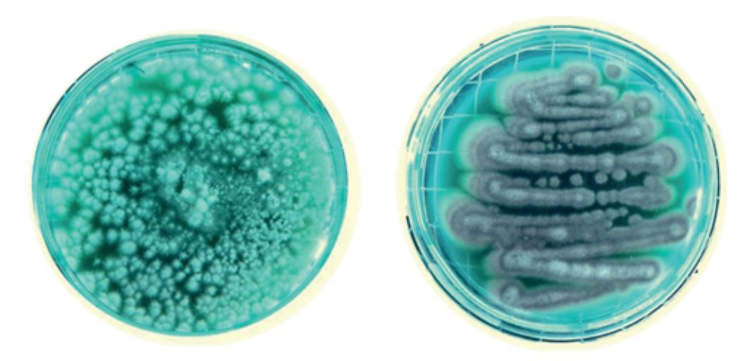
Figure 1: Purified fungi on Potato Dextrose Agar (PDA) medium.