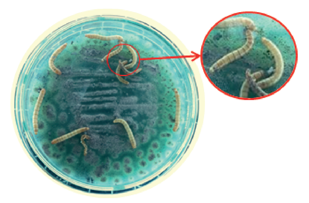
Figure 3: No fungal infection of samples fungi isolates K.2 observed to Tenebrio molitor larvae.

Figure 3). This indicated that the colony K.2 does not possess the entomopathogenic ability.