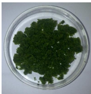
Figure 1. Raw Seaweed

Raw seaweed was green and having fishy odour. The chemical composition of the productcan be shown in Table 1 and Table 2. Table 1 showed that raw seaweed content of high carbohydrate and micro nutrient but low in protein and lipid content.This seaweeds Gracillariasp contains 162 Kcal energy, very low protein (0,8g/100g), lipid (0,5g/100g), and high in micro minerals such as Calcium, iron and iodine (Table 1)