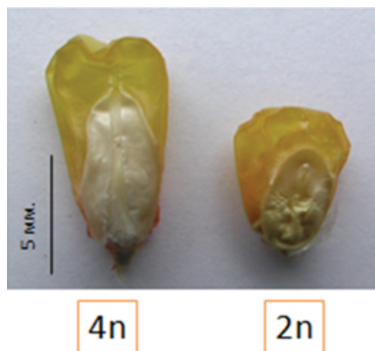
Figure 5: Caryopses of tetraploid sweet corn, Baksanskaia Sugary (left) and Nika-353 (right). [18]

the essential for human fatty acids (oleic, arachidonic, linoleic and linolenic) were found in tetraploid sweet corn grain, however their content in different specimens varied. The maximum total content of fatty acids, including essential ones, was found in specimen C-1576.