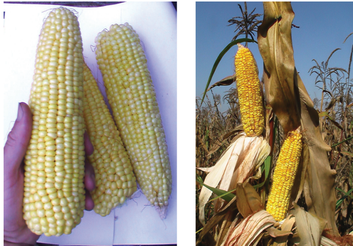
Figure 4: Ears of tetraploid sweet corn, variety Baksanskaia Sugary in the phase of milky (left) and full (right) ripeness. [18].