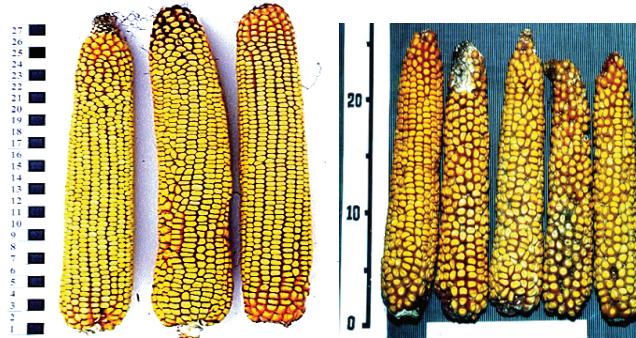
Figure 3: Ears of tetraploid MRPP-20 corn after 10 cycles of selection (left) and its source material from the first cycle of selection (right) [14].

of su2 gene alleles and to improve evenness of sweet corn phenotypic traits. From the best lines of tetraploid sweet corn selected for their seed production, a new variety of sweet corn had been created by the method of polyhybrid crossing. It was registered as Baksanskaia Sugary with the Russian State Register of Selection Achievements in 2011 (patent no. 6335 dated 01.02.2012) (Fig. 4). The Baksanskaia Sugary var. of tetraploid sweet corn has a number of advantages over the diploid standard to to a larger multiple-row ear with a good seed production and longer and larger caryopses on the ear (Table 1).