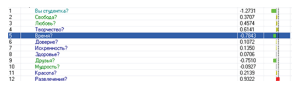
Figure 2: Time as a significant phenomenon in the system of individual values.

Thus, the conclusion about the significance of the concept was made on the basis of comparisons of lexical and psychophysiological values of the category studied. An explicit concept of time in the system of individual values is shown in Figure 2.