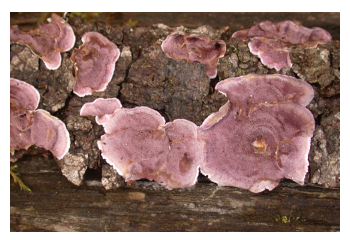
Figure 2: Skeletocutis lilacina. P. Corfixen 97.159; photo by H. Knudsen.

three localities. The same situation occurs in the Magadan region, where the greatest diversity of fungi on P. pumila was found in the vicinity of the village of Yagodnoe (8 species) and in the Snowy Valley (9 species): only T. fuscoviolaceum is present in both localities (Table 2).