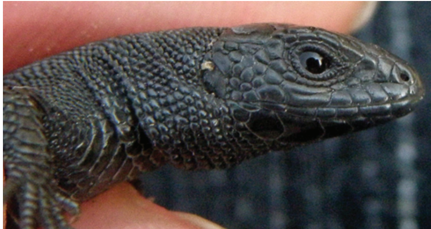
Figure 2: Melanistic viviparous lizard from the Poltava region.