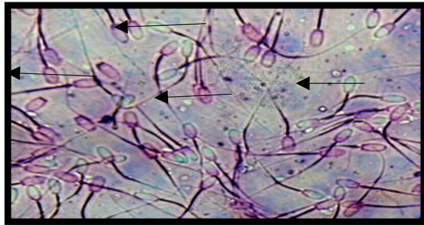
Figure 1: Test of Spermatozoa Viability (400X magnification). Live spermatozoa with white head (a) and dead spermatozoa with red head (b).

sperm motility (+++), and individual motility 80%. Based on the results of macroscopic and microscopic fresh sperm fat tailed sheep are still worthy of further research.