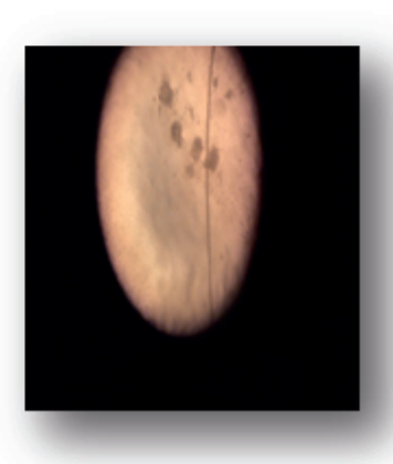
Figure 1: rabbit with positif scabiosis.

This process takes time for 1 week and has been confirmed by scraping ie identifying the Sarcoptes scabei in rabbit models.