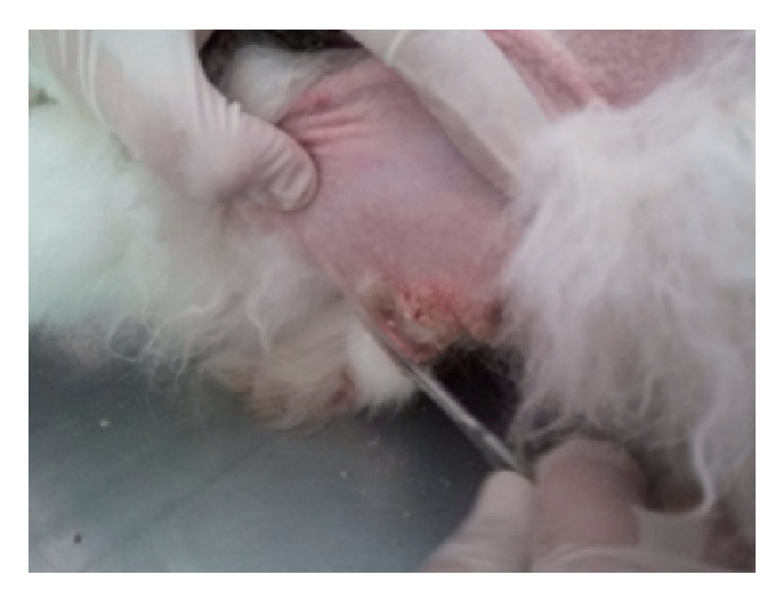
Figure 2: Scraping.