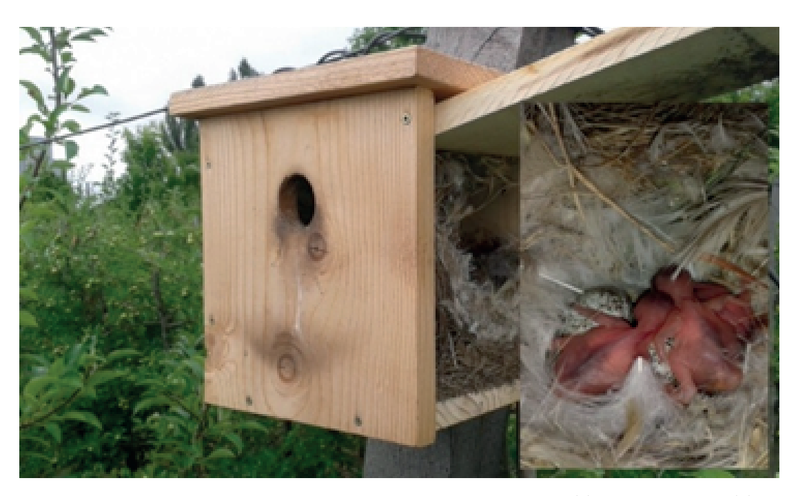
Figure 4: Passer montanus nest occupied, not prayed by the woodpecker (a); Detail of the nest (b).

In the same location, from 6 nests, Model B 35, 6 nests were occupied by Passer montanus (Tree Sparrow – Fig. 4) and 5 of them were prayed by woodpeckers. Woodpeckers increased the nests entrance holes till 43 mm in order to enter the nest and to pray the eggs and chicks (Fig. 3).