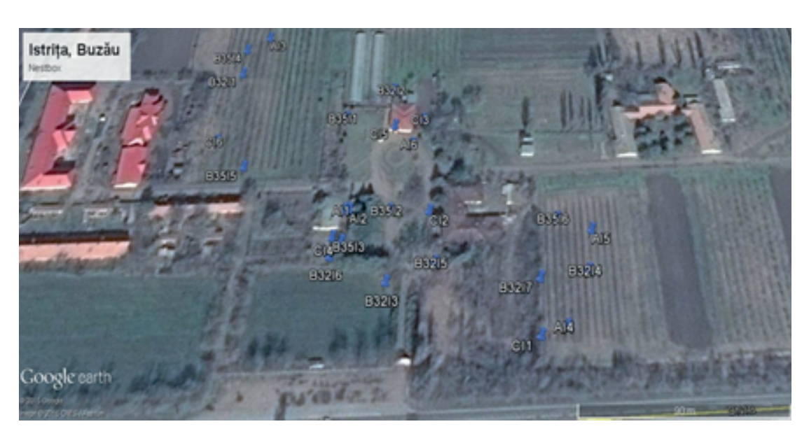
Figure 1: Example of artificial nests distribution map at Istriţa Fruit Station, Buzău.

The Great Spotted Woodpecker ( Dendrocopos major ) has an unpredictable behavior, stealing the eggs or juvenile birds from other nests [4]. During the breeding period, Dendrocopos major mainly feed on Lepidoptera, and also coleoptera, hymenoptera, orthoptera, and diptera. They exceptionally may consume eggs and juvenils from other bird nests or even small mammals [5].