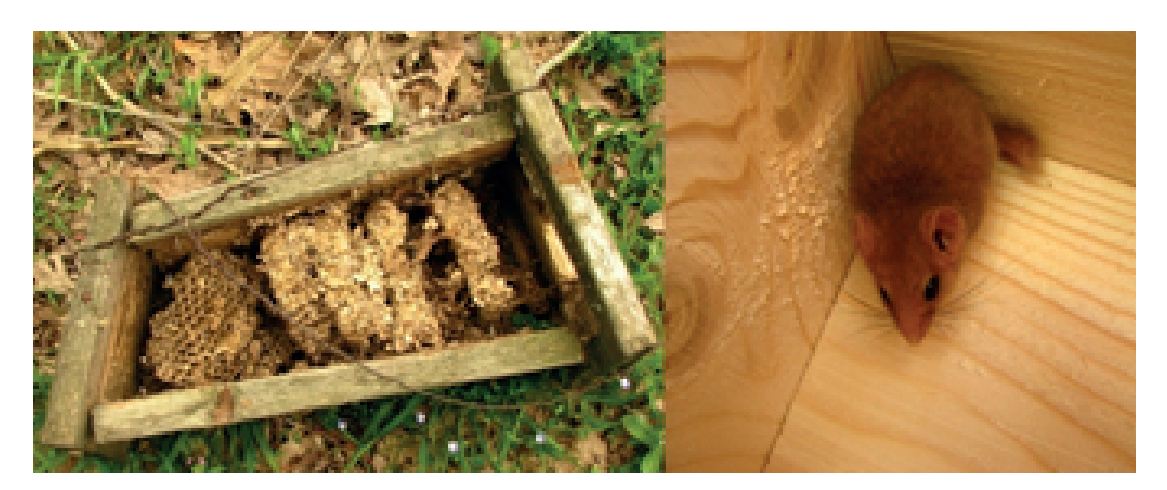
Figure 5: European Hornet ( Vespa carbro ) (a) and Hazel dormouse ( Muscardinus avellanarius ) (b) in the bird nest.

in 3 areas. In order to protect the artificial wood nests against the woodpeckers attack, the entrance hole has to be reinforced with a metal layer. In the situations in which the food source of Great Spotted Woodpecker ( Dendrocopos major ) that normally is insects, is in great decrease, this species is searching for other proteic food source, thus eating other birds species eggs and the immature birds. The insects decreasing – in number and diversity – in an anthropic ecosystem may be influenced by the chemical pesticides applied for plant protection. Bird artificial nests build for dedicated species, can be occupied also by insects as European hornet ( Vespa crabro ) or even mammals as Hazel dormouse ( Muscardinus avellanarius ). Further studies are needed to better understand the Woodpeckers ethology in order to prevent and limit the damage and pray of useful bird nests.