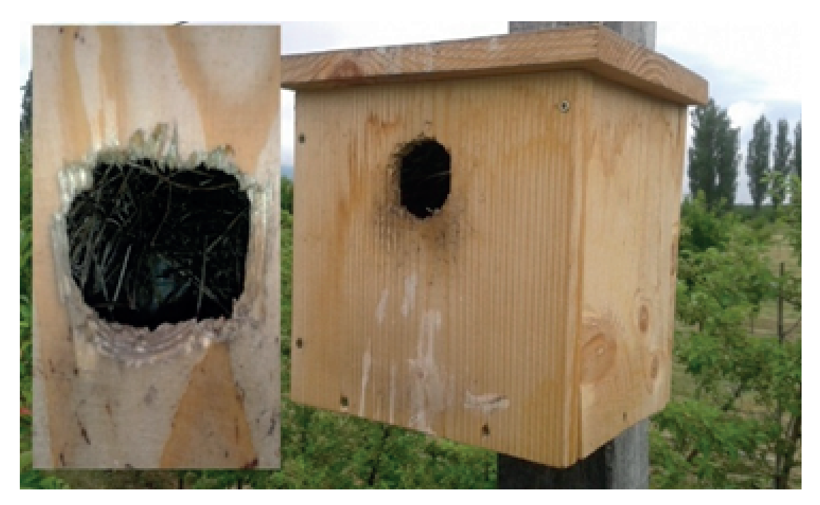
Figure 3: Prayed nests by Dendrocopos major (Great Spotted Woodpecker).

In Istriţa orchard from the 7 installed nests of Model B 32, 4 nests were occupied by Passer montanus (Tree Sparrow). All occupied nest were prayed by woodpeckers (Fig. 3).