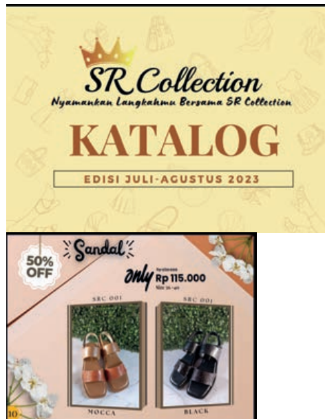
Figure 6: SR Collection Catalog.