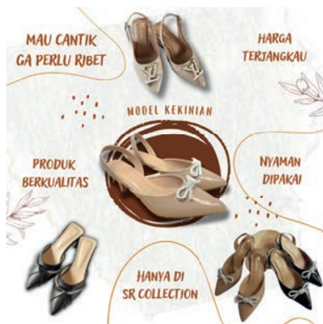
Figure 7: SR Collection Instagram Feed.