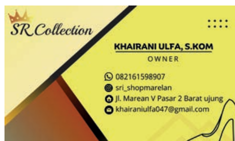
Figure 4: SR Collection Name Card.