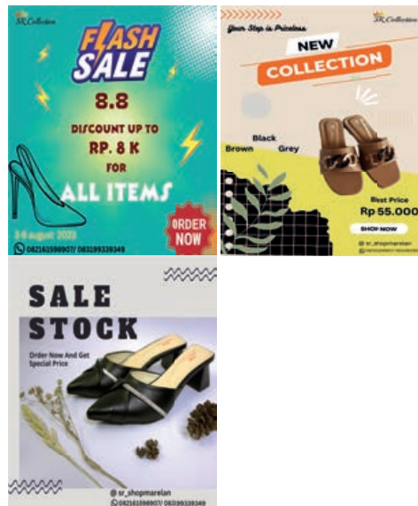
Figure 9: SR Collection Flyer.