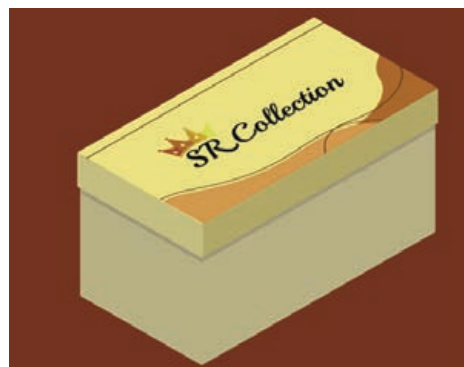
Figure 3: SR Collection Shoe box.