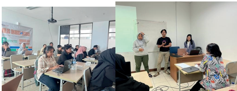
Figure 1: Incubation Classes.

In this research, the stages of Incubation Classes and Exhibition can be determined as marketing channels. Marketing channel is something forged by organizations to help products available for use by consumers [5]. Incubation Classes were held to give 24 students preparation to pitch their projects in front of investors. During the class, participants implement the knowledge given by instructors. They created pitch decks and performed pitching simulation.