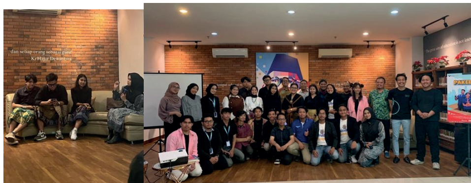
Figure 2: Exhibition.

This stage resulted in pitch decks to be presented during Exhibition. There are eight pitch decks for eight television programs to be screened and exhibited in front of investors. Those investors came from national television or broadcasting agency such as TVRI, MOJI, MentariTV, FlipFlopTV, as well as some production houses like Visinema, Kepik Production, and AFE Cinema. During the Exhibition, students presented and pitched their programs on how they were made, to show investors that these programs are worthy being produced on industrial level. They argued about having high media value and competitive quality contents to be produced by national broadcasting agencies.