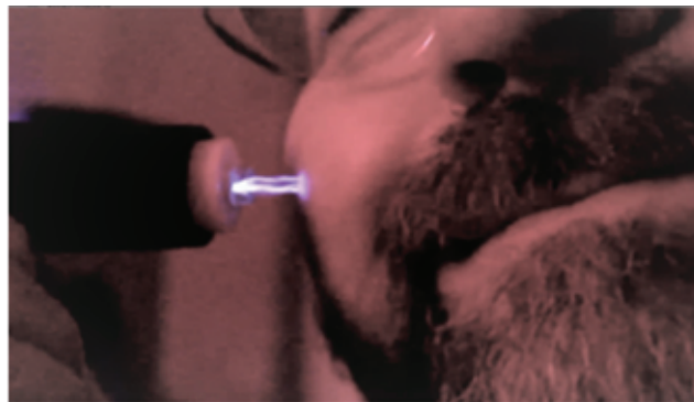
Figure 2: Testing of a test bench prototype

Proceeding from the conducted researches [6], it is possible to assert that cold atmospheric pressure plasma is a useful tool for the treatment of chronic wounds. In addition to antimicrobial effects, plasma can stimulate wound healing, accelerating cell proliferation through the modulation of signal molecules. Besides, the article substantiates that during exposure to low-temperature plasma, a reduction in the size of the damaged area and improvement in the overall health of patients were found [6]. Also, in the course of the study, the first results of the project on blood coagulation caused by direct interaction with the helium plasma stream were presented in practice. In vitro studies have shown that the use of plasma does accelerate coagulation. The result was confirmed by animal models. The above experiments prove the increase in healing efficiency in the application of this technology [7].