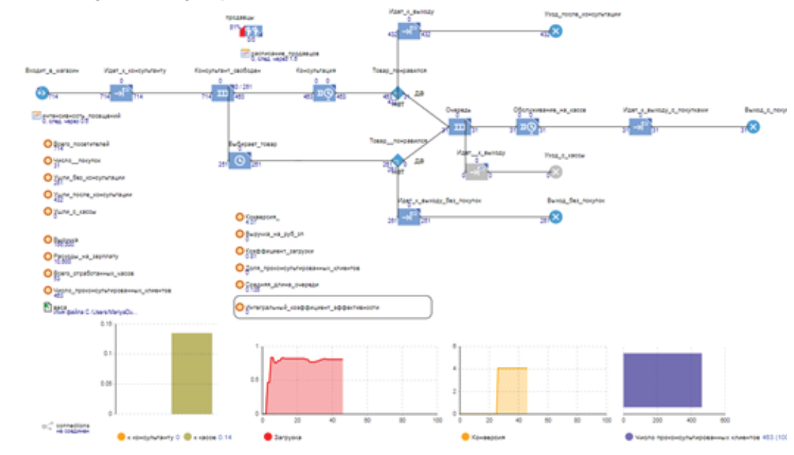
Figure 3: Scheme with indicators

The figures below show the results: a block diagram with indicators (Figure 3).